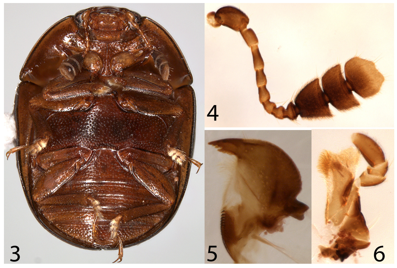
FIGURES 3-6. External characters of C. thomasi n. sp. (3) Ventral habitus; (4) right antenna; (5) right mandible; (6) right maxilla.

Description. Overall, body circular to slightly elliptical and highly convex dorsally. Length 2.8 mm (n = 19; one specimen missing head), width 2.0 mm (n = 20). Body unicolorous dark chestnut brown with abdomen and thoracic ventrites somewhat lighter. Surface sculpturing on dorsum consisting of minute punctures with finely granular to microreticulate interspaces between punctures. Body setation absent on dorsum; entire surface glossy and shining (Fig. 2).