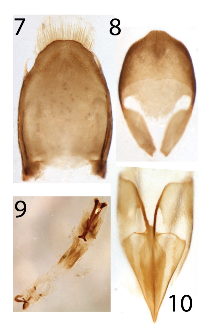
FIGURES 7–10. Genitalia of C. thomasi n. sp. (7) Male tegmen; (8) Male median lobe; (9) male internal sac sclerites; (10) female ovipositor.