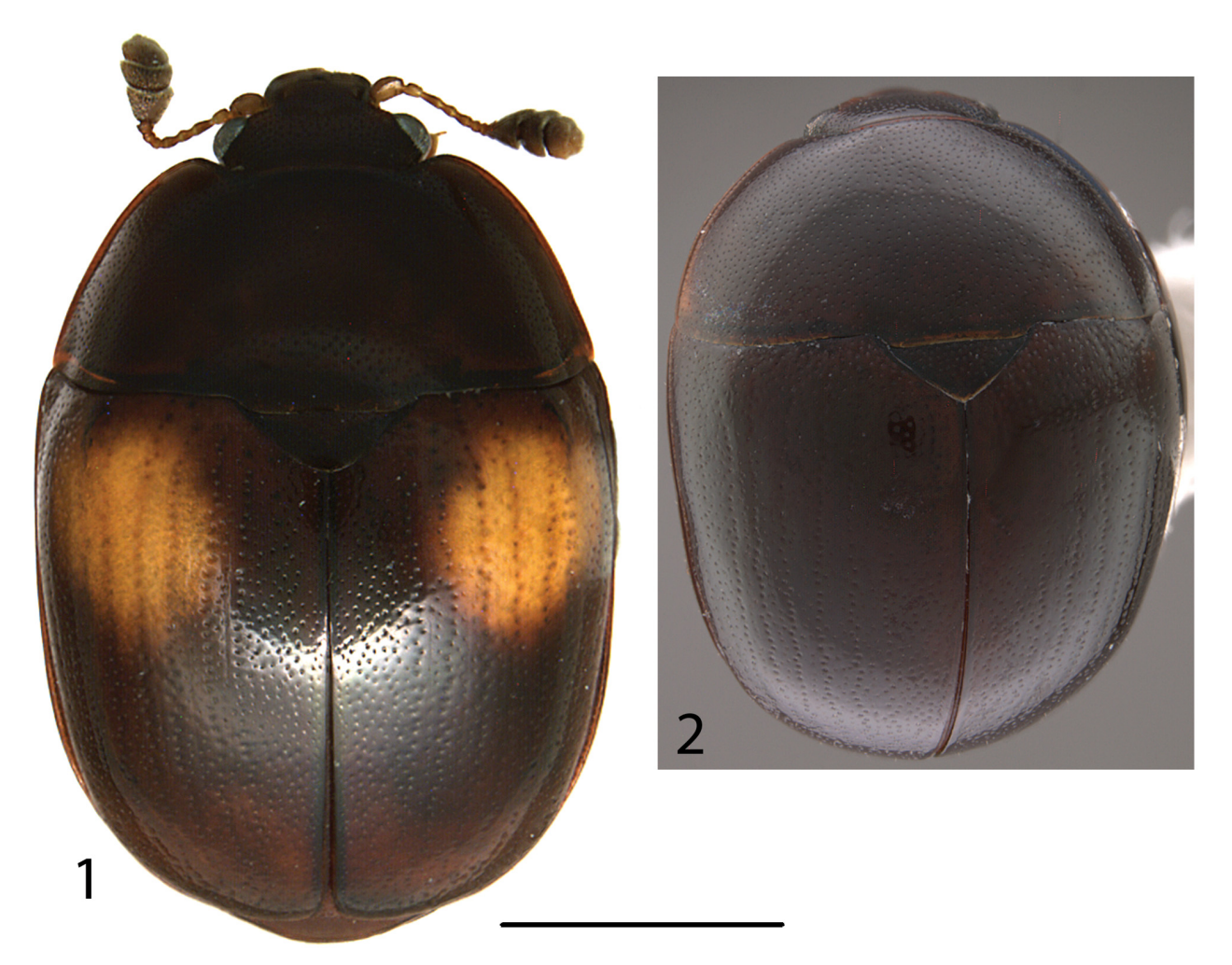
FIGURES 1–2. Dorsal habitus images of North American species of Cyllodes . (1) C. biplagiatus LeConte. (2) C. thomasi n. sp. Scale bar = 1 mm.