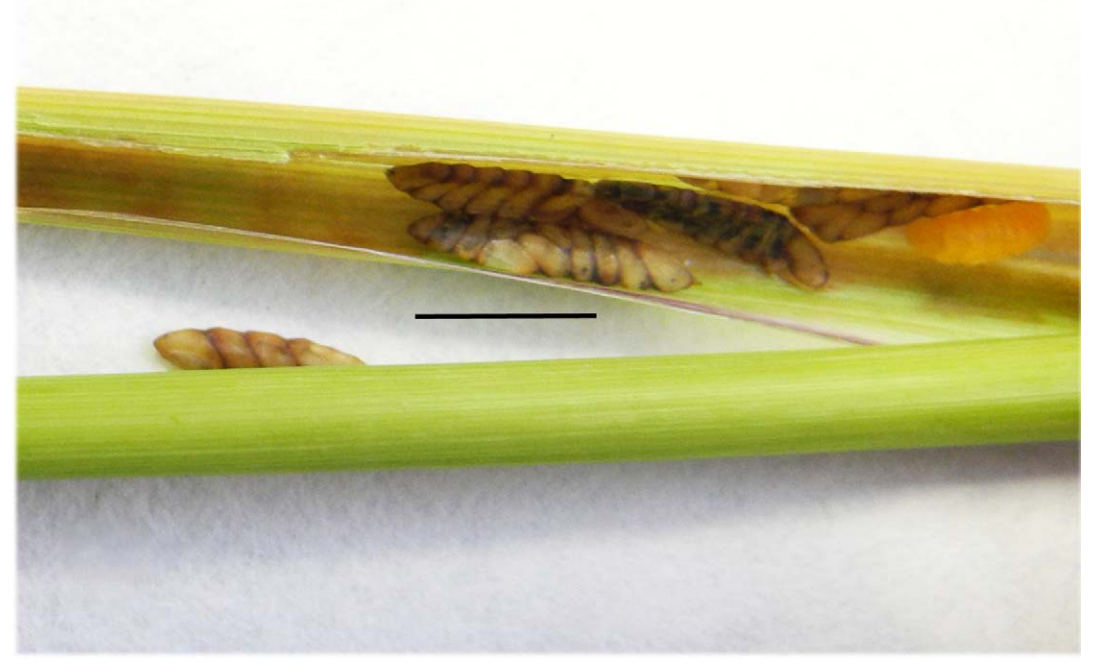
FIGURE 6. Panicum virgatum apical leaf sheath opened to show P. chilophagae coccons and a C. virgati larva in situ; scale bar = 5.0 mm.

♂. Body length 1.05 mm approx. Antenna with A5–A9 each as long as wide, flagellar pubescence half as long as width of segments. Metasoma 0.85 times as long as head and mesosoma combined, with seven visible tergites.