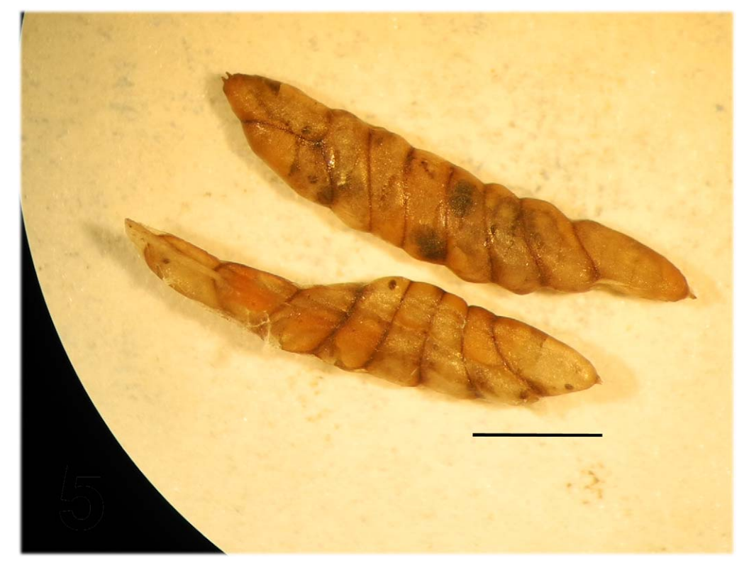
FIGURE 5. Cocoon clusters of P. chilophagae ; scale bar = 2.0 mm.

Mesosoma (Figs. 1–2) 1.4 times as long as wide, about as high as wide. Sides of pronotum finely longitudinally reticulate-coriaceous, smooth along wide upper and hind margins. Mesoscutum with few setae, most of them along margins and imaginary notaulic courses, smooth in more than posterior half, finely reticulate around ends of imaginary notaulic courses and along anterior margin; notauli weakly indicated in posterior half; mid lobe slightly prolonged to base of scutellum, touching this in a rather narrow point, at each side with about six setae above scuto-scutellar grooves. Mesopleuron smooth. Scutellum smooth, moderately densely setose, evenly convex. Metapleuron with pilosity all over. Propodeal carinae short, parallel, much transverse area between them smooth. Forewing very slightly surpassing tip of metasoma, slightly more than 0.7 times as long as entire body, 2.6 times as long as wide, clear, with dense and rather fine microtrichia in apical 0.6; marginal cilia 0.08 times width of wing. Hind wing 5.5 times as long as wide, with two hamuli; marginal cilia 0.3 width of wing.