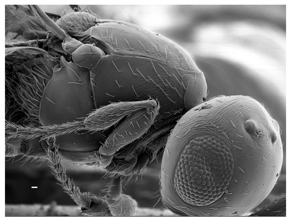
FIGURE 2. Platygaster chilophagae , \stackrel{\circ}{\downarrow} , head and mesosoma in lateral view, scale bar = 10 µm.