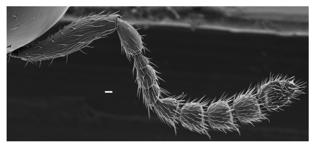
FIGURE 4. Platygaster chilophagae , ^{\bigcirc}_{+} , antenna, scale bar = 10 µm.