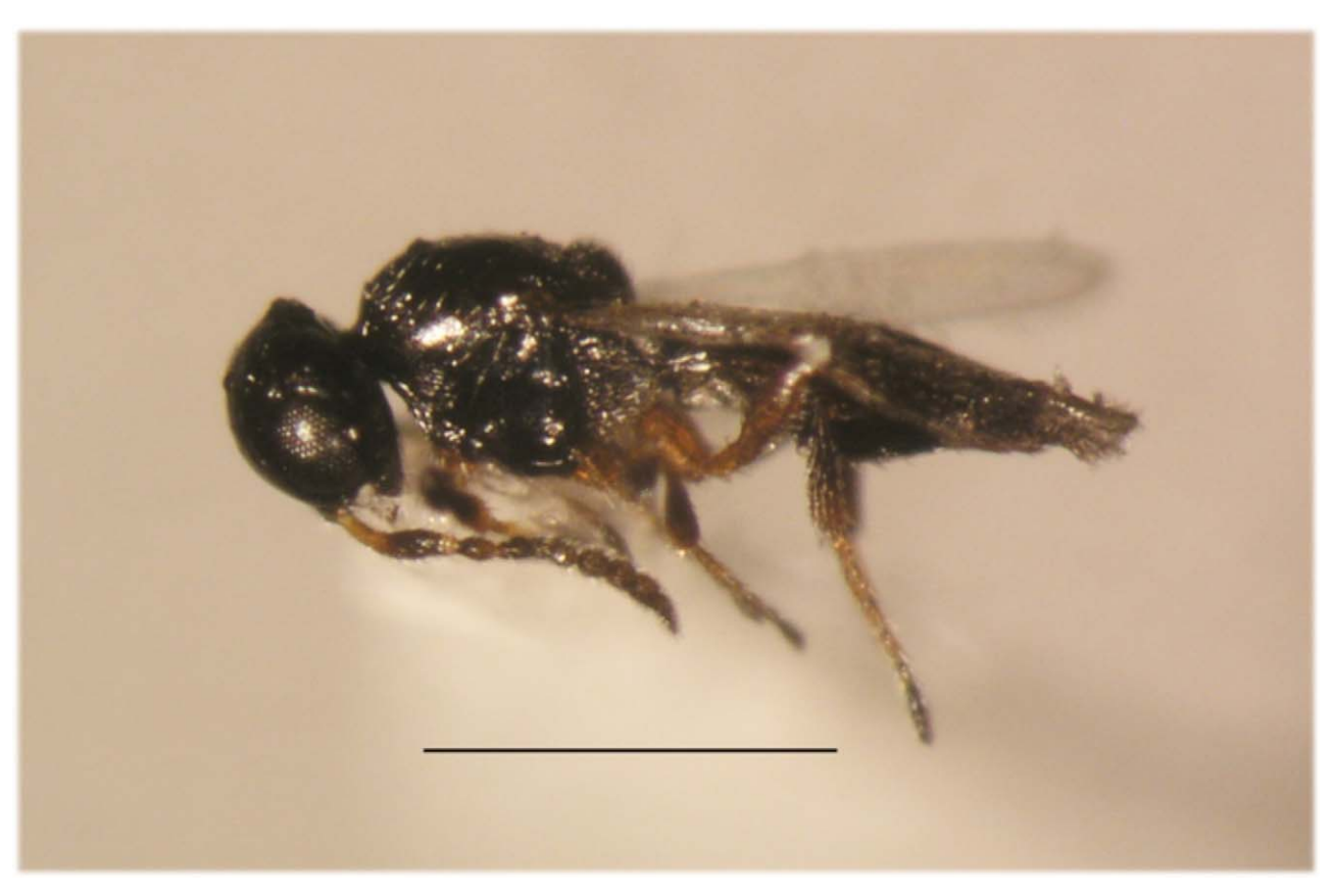
FIGURE 7. Platygaster chilophagae , \stackrel{\bigcirc}{_{+}} lateral habitus; scale bar = 0.5 mm.