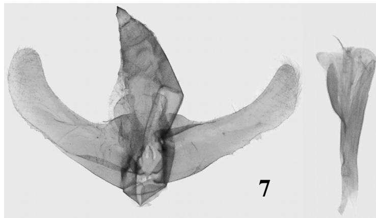
FIGURE 7. Male genitalia of Lakshmia pandava Yakovlev & Nakao, sp. nov. , holotype.