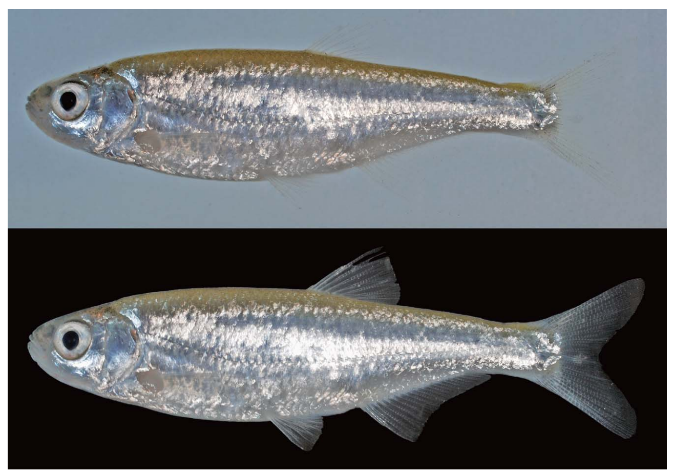
FIGURE 1. Freshly collected specimen of Meztia bounthobi (holotype, 57.0 mm SL, NIFI 4680), Mekong Basin in Sopvan, Nyoi District, Luang Prabang Province, Lao PDR (20°36.5'N, 102°39.1'E), 23 June 2010. Same specimen above and below but on different backgrounds to provide full view of characters of the species.

Luang Prabang Province, Lao PDR, 15 August 2008, collected by P. Phousavanh; NULFA-P 719, 1 specimen, 33.1 mm SL, Ou River, Pak Bak, Ngoy District, Luang Prabang Province, Lao PDR., 16 August 2008, collected by A. Iwata and P. Phousavanh; NULFA-P 720, 1 specimen, 40.1 mm SL, Ou River, Hat Sa, Phongsaly District, Phongsaly Province, 19 September 2007, collected by P. Phousavanh; NULFA-P 721, 1 specimen, 38.7 mm SL, collected with NULFA-P 720; NULFA-P 722, 1 specimen, 38.3 mm SL, Nam Pok River (a tributary of Ou River), Samphan District, Phongsaly Province, Lao PDR, 19 October 2009, collected by P. Phousavanh; NULFA-P 723, 1 specimen, 36.4 mm SL, collected with NULFA-P 722; NULFA-P 724, 1 specimen, 35.9 mm SL, collected with NULFA-P 722.