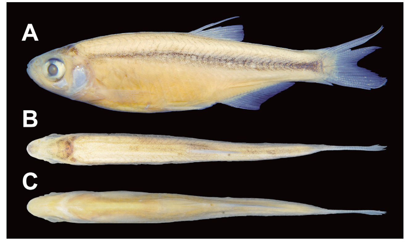
FIGURE 2. Preserved specimen of Meztia bounthobi , new species (holotype, 57.0 mm SL, NIFI 4680). (A) lateral, (B) dorsal and (C) ventral views.

Description. In the following description, the counts of the holotype are asterisked, and the frequency or each count is given in parentheses following the relevant count. Dorsal-fin rays 3 unbranched and 7*(10) branched rays, last one split to base; anal-fin rays 3 unbranched and 18*(4), 19 (2) or 20 (3) branched rays, last one split to base; total pectoral-fin rays 12*(7) or 13*(13), including uppermost 1*(20) and lowermost 1 (8) or 2*(12) unbranched rays; total pelvic-fin rays 8*(18), including anteriormost 1*(20) and innermost 1*(20) unbranched rays; branched caudal-fin rays 9+8*(10); lateral-line scales 49(1), 50(2), 51*(4), 52(3), 53(5), 54(1) or 55*(2), followed by 2*(8), 3*(9) or 4(1) pored scales on caudal fin; transverse scale rows above lateral line 9(4), 10*(13) or: 11*(1); transverse scale rows below lateral line 4*(16) or 5(2); predorsal scale rows 33(3), 34*(3) or 36(2); circumpeduncular scale rows 20(2), 21(4) or 22*(3); gill rakers on outer surface of first gill arch 0+8(1), 1+7(2), 1+8*(3), 1+9(2), 2+7(1) or 2+8(1).