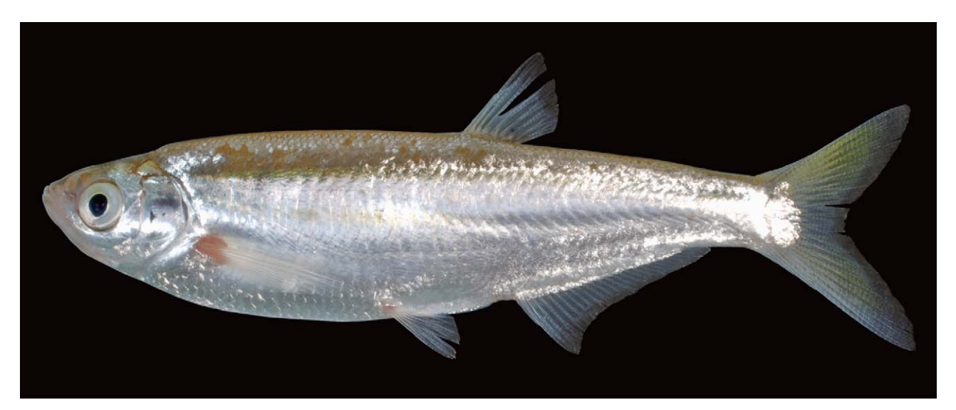
FIGURE 4. Paralaubuca barroni , NUOL-P 4038, 75.4 mm SL, Nyoi District, Luang Prabang Province, Lao PDR.

Etymology. The specific name, bounthobi , is in honour of Bounthob Praxaysombath (NUOL), who was the leading researcher performing the field surveys throughout the NUOL-NEF project on 2007–2010. Eight of all 10 type series of the new species were brought from the project surveys.