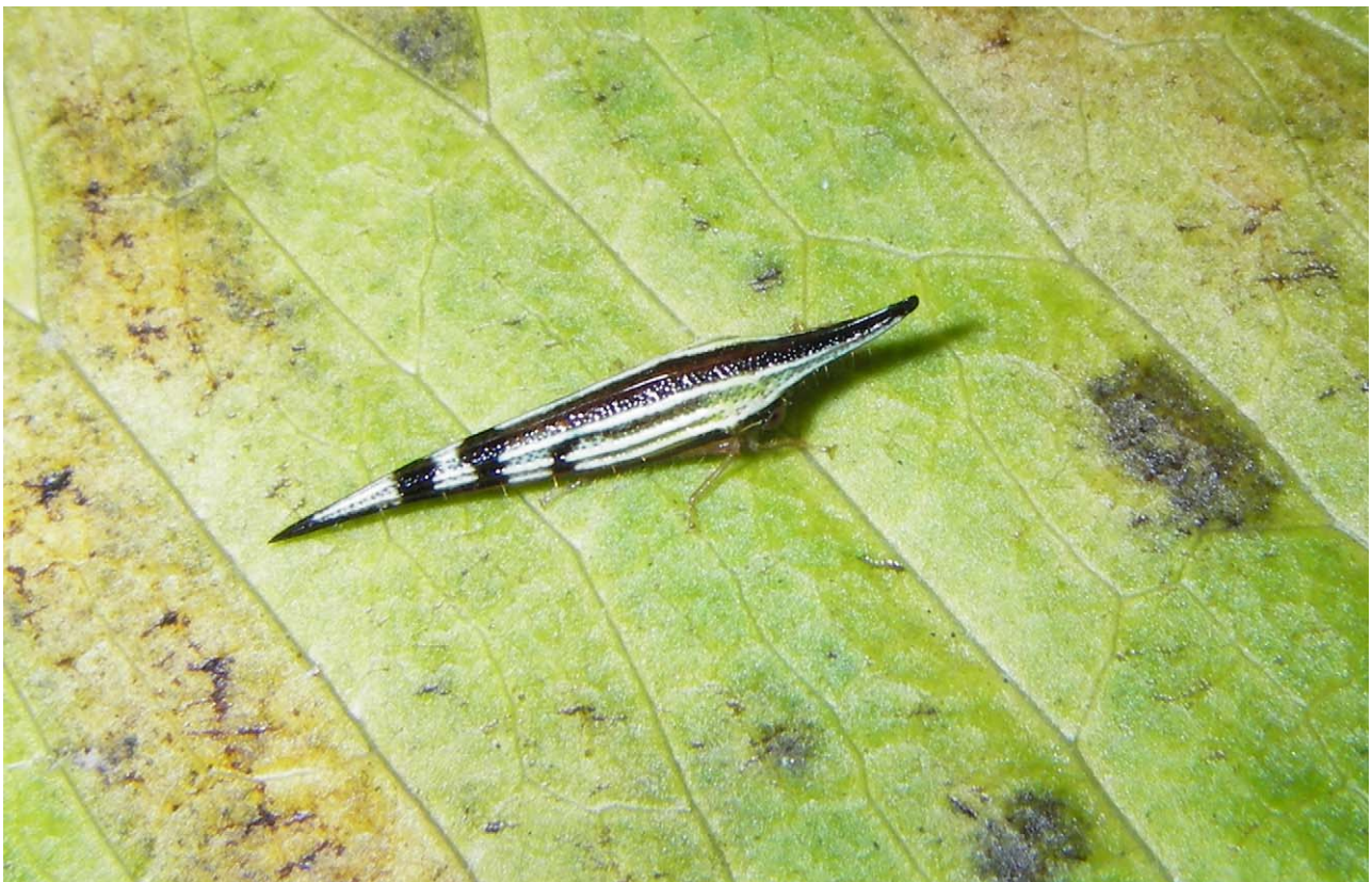
FIGURE 1. Polyglypta dorsalis Burmeister taken at Fortuna Dam, Chiriquí Province, Panama.