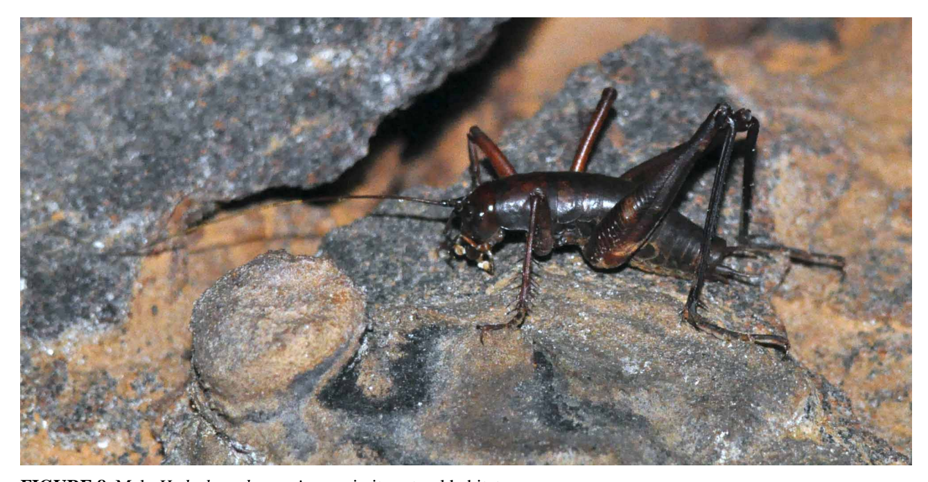
FIGURE 8. Male Hydrolutos breweri sp. n. in its natural habitat.

Material examined. Holotype. 1 & body length 43.2 mm, Venezuela, Edo. Bolívar, Chimantá Massif, Churí tepui, Cueva Charles Brewer, ca 2300 m a.s.l., 15.I. 2009. Holotype has been preserved dry and pinned. Paratypes. & body length 43 mm, 1 & nymph, body length 30 mm. The same data as holotype. The paratypes are stored in 70% ethanol. Holotype and paratypes will be deposited in Museo del Instituto de Zoología Agrícola (MIZA), Facultad de Agronomía, Universidad Central de Venezuela, Maracay, Edo. Aragua, Venezuela.