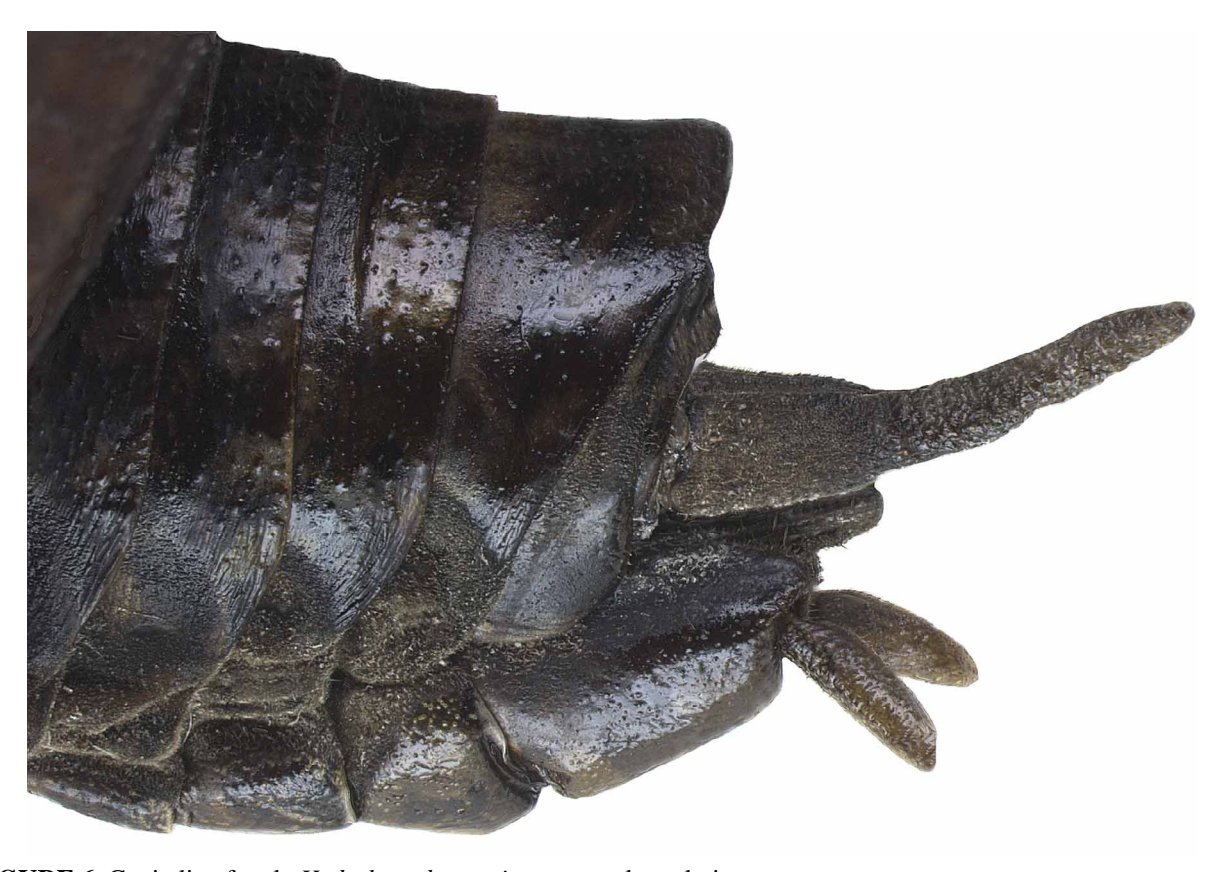
FIGURE 6. Genitalia of male Hydrolutos breweri sp. n. —a lateral view.