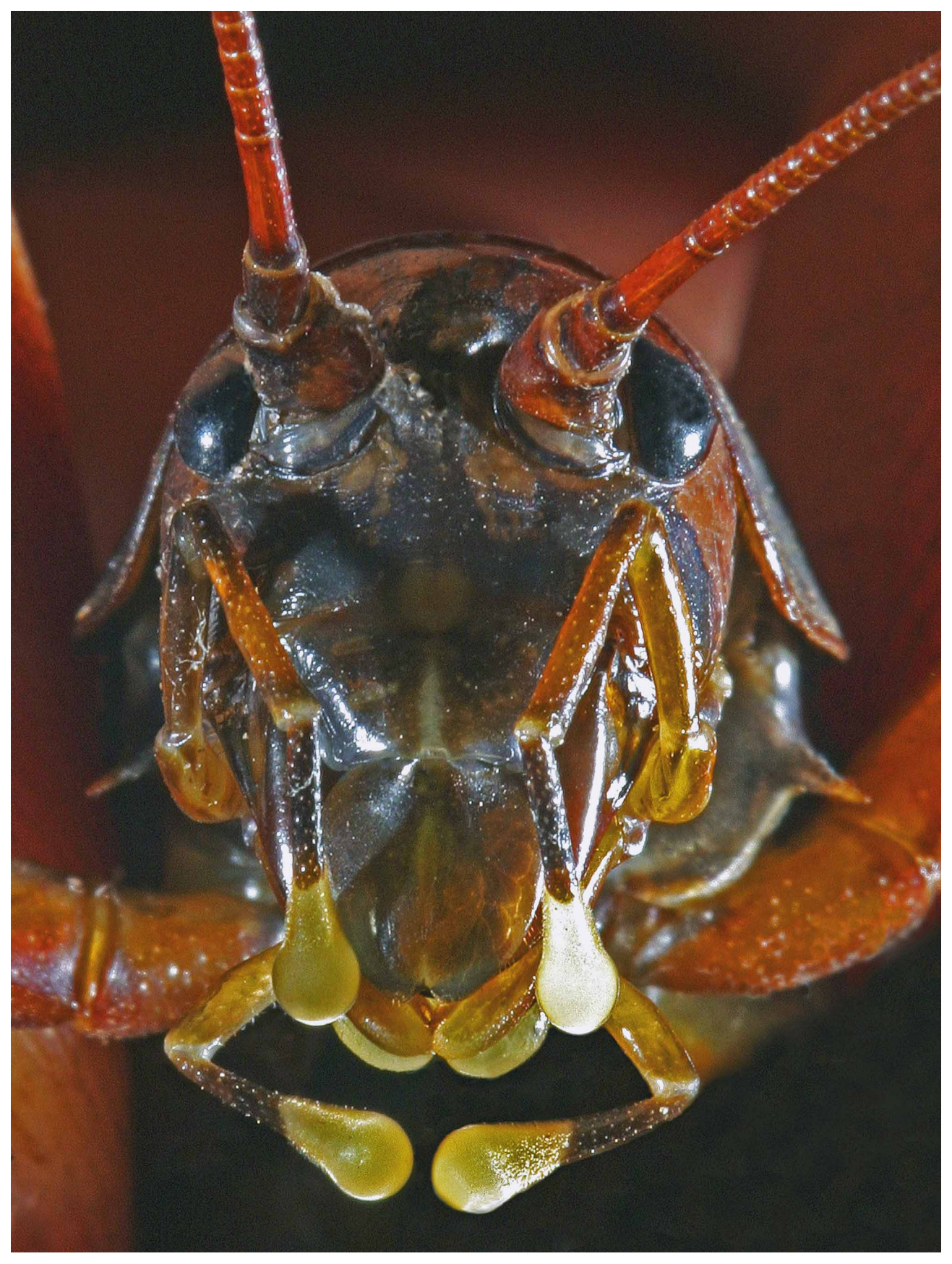
FIGURE 4. Head of male Hydrolutos breweri sp. n. —a frontal view (photographed by C. Brewer-Carías).