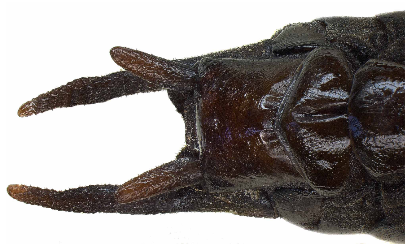
FIGURE 7. Genitalia of male Hydrolutos breweri sp. n. —a ventral view.