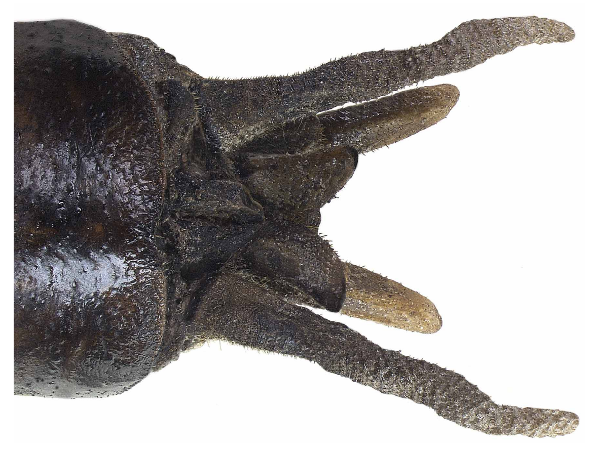
FIGURE 5. Genitalia of male Hydrolutos breweri sp. n. —a dorsal view.