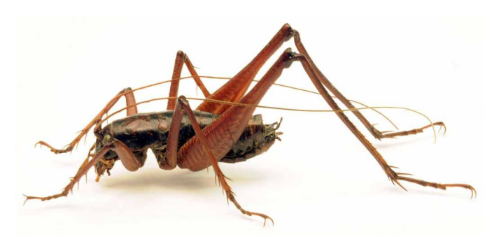
FIGURE 3. male Hydrolutos breweri sp. n. —a total view.

Head: Antennal flagellum about 2.5 times total body length, proximally smooth, in middle and distal section swollen and covered by short fine microsetae. Fastigium as broad as antennal segment S1, horizontal, slightly flattened, not declinate, with a median carina. Vertex convex, clypeus subtriangular with indistinct median carina. Labrum heart-shaped, proximally broader than distally, with median carina in its apical half. Maxillary palps bright, the last segment swollen and covered by short fine and soft microsetae. Eyes elevated in frontal view (Fig. 4).