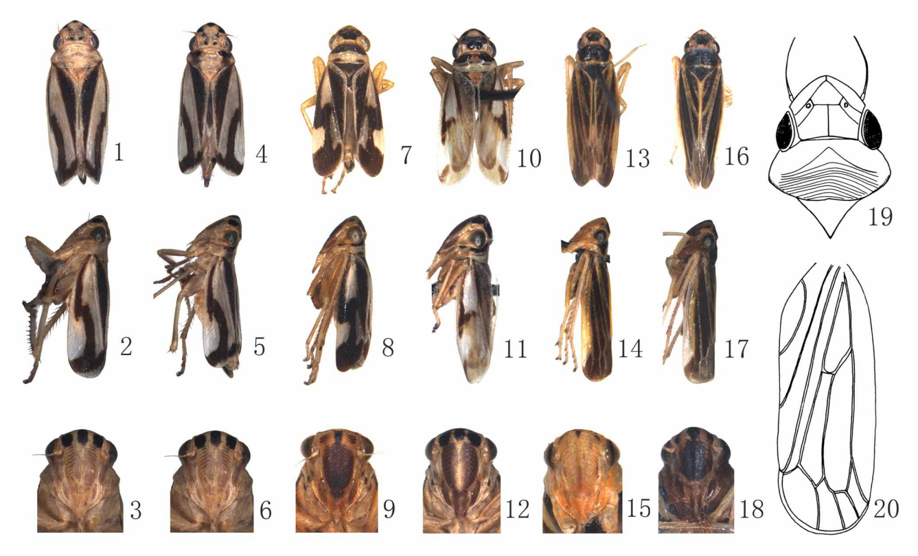
FIGURES 1–20. Habitus, face and forewing. 1–6: B. trimaculatus ; 7–12: B. ancinatus sp. nov.; 13–18: B. nigronotus sp. nov.; 1–3, 7–9, 13–15 male; 4–6, 10–12, 16–18 female; 19–20: head and forewing of B. trimaculatus , respectively.

Material examined: 1 ° (Holotype, NWAFU), China: Shaanxi Prov., Ningshan County, Huoditang, 15– June-1985, coll. Li Jinfang; 10 ° °, 10 ° ° (NWAFU), China: Shaanxi Prov., Ningshan County, Huoditang, 8~30-June-1995, coll: Li Jinfang; 3 ° ° (NWAFU), China: Shaanxi Prov., Mt. Huashan, July-1979, coll. Tian Chou & Chen Tong; 1 ° (NWAFU), China: Shaanxi Prov., Huxian County, Huashuping, 27-June-2007, coll. Zhou Shun; 4 ° °, 5 ° ° (NWAFU), China: Henan Prov., Songxian County, Mt. Baiyunshan, 1400m, 15-July-1996, coll. Zhang Wenzhu; 10 ° °, 10 ° ° (NWAFU), China: Henan Prov., Luanchuan County, Longyuwan, 12-July-1996, coll. Zhang Wenzhu; 1 ° (NWAFU), China: Sichuan Prov., Ya'an County, 12-July-1939, coll. Chou Io, Zheng Fengying & Hao Tianhe.