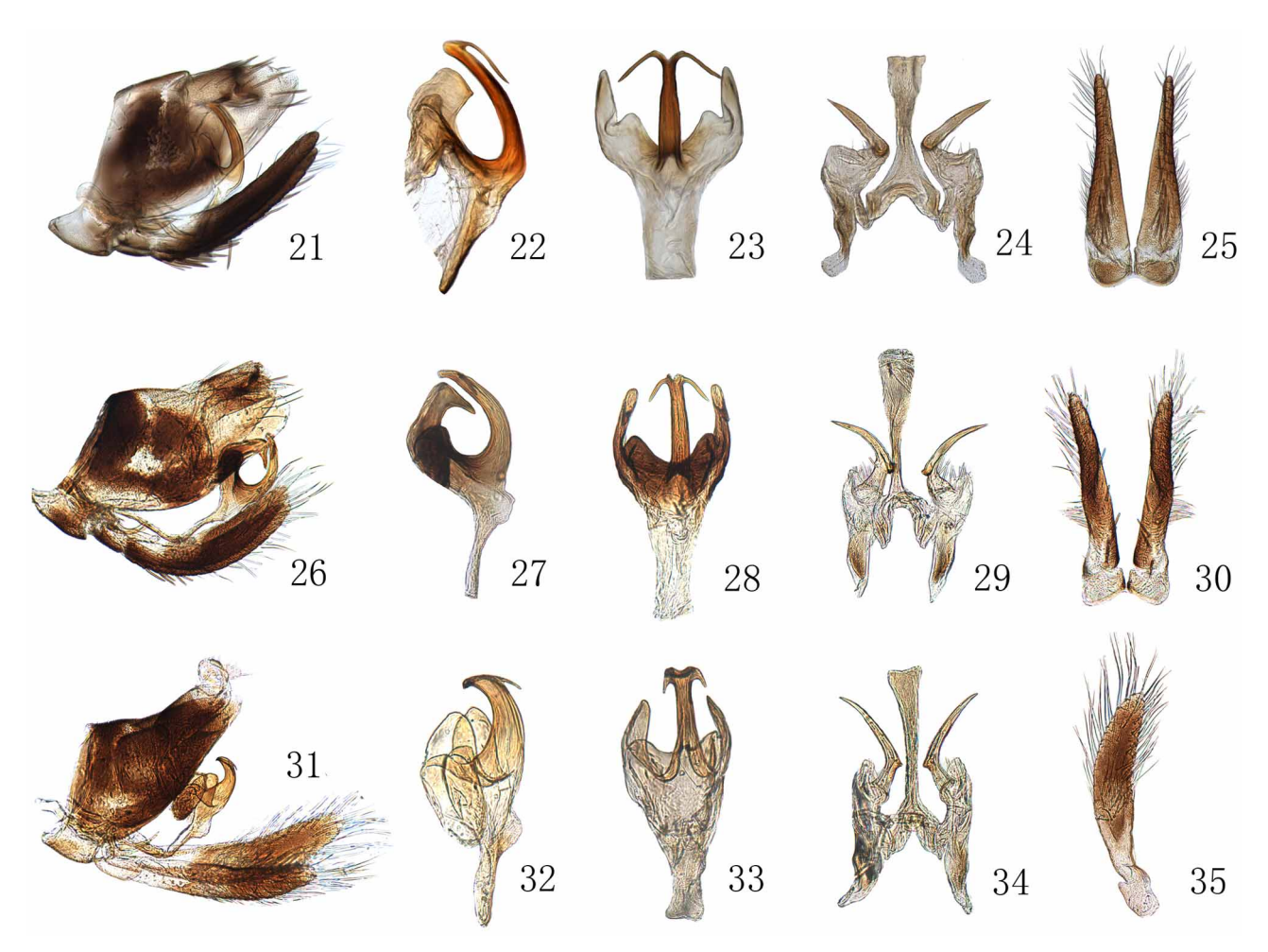
FIGURES 21–35. Male genitalia. 21–25: B. trimaculatus ; 26–30: B. ancinatus sp. nov. 31–35: B. nigronotus sp. nov.; 21, 26, 31: male pygofer, lateral view; 22, 27, 32: aedeagus, lateral view; 23, 28, 33: aedeagus, ventral view; 24, 29, 34: connective and style, dorsal view; 25, 30, 35: subgenital plate, ventral view.

Remarks: This species is similar to B. trimaculatus Li & Wang, but can be distinguished from the latter by the pattern of black patch on the vertex, the shorter apical aedeagal processes, and the hook-like anterior processes near the middle of the aedeagus.