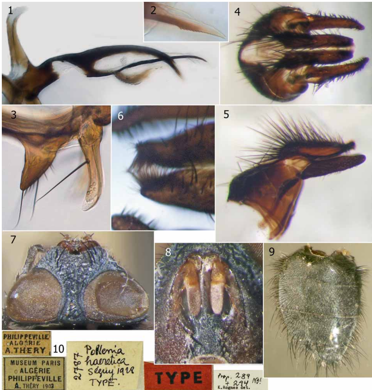
FIGURES 1–10. Pollenia haeretica Séguy, male (1–5 from “Tunisia, 10 km N Korba ...” specimen in ZMUC; 6, 9 from “Sorgono, Sardegna ...” specimen in BMNH; 7–8, 10 from lectotype of Pollenia haeretica Séguy in MNHN). 1. Aedeagus, left lateral view. 2. Tip of paraphallic process (large magnification). 3. Pre- and postgonites. 4. Cerci and surstyli, posterior view. 5. Cerci, surstyli, epandrium and bacilliform sclerites, left lateral view. 6. Tip of cerci (large magnification). 7. Head, dorsal view. 8. Facial region, from in front. 9. Abdomen, oblique view. 10. Four original labels and K.R.’s label referring to MNHN slides.