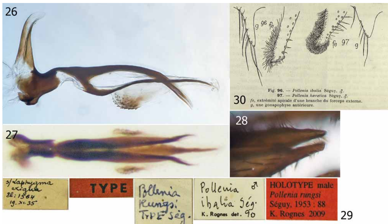
FIGURES 26–30. 26–29. Pollenia ibalia Séguy, male (from holotype of Pollenia rungsi Séguy in MNHN). 26. Aedeagus, left lateral view. 27. Aedeagus, dorsal (posterior) view. 28. Tip of cerci, slightly oblique view. 29. Three original labels, determination label and holotype label by K.R. 30. Right pregonite and tip of cercus of P. ibalia (left) and P. haeretica (right) [reproduced from Séguy 1930: 148, figs. 96 and 97, by permission].

printed]; (4) my holotype label ( ibalia Séguy). The specimen has been dissected by K.R.. The abdominal T1–5 are glued to a card on the pin above the labels, and the ST1–5 and genitalia are kept in glycerol in a glass microvial below label (3). Paratypes (2 males, both in MNHN): 1 male labelled (1) “MUSÉUM PARIS // MAROC // MOYEN ATLAS // RAS EL KSAR 900 m // F LE CERF // 12/13 VI 1929” [printed on greyish blue label]; (2) “ ibalia / E. Séguy det. 19” [handwritten by Séguy, except last line which is printed]; (3) “ag 292 / K. Rognes det.” [handwritten in pencil on white label, except last line which is printed; ag = appareil genital]; (4) “Genital slide / no. 292 / “ Pollenia ibalia n.sp.”” [printed on red label; label prepared by K.R.]; (5) my paratype label ( ibalia Séguy). Slide 292, also in MNHN, is a Canada balsam mount of the ST5 and the genitalia labelled “292” [left side of slide] and “ Pollenia / ibalia / n.sp. ” [right side] [all text in pencil in Séguy’s handwriting]. • 1 male labelled (1) “MUSÉUM PARIS // MAROC // MOYEN ATLAS // RAS EL KSAR 900 m // F LE CERF // 12/13 VI 1929” [printed on greyish blue label]; (2) my paratype label ( ibalia Séguy). Not dissected, but cerci and surstyli clearly visible.