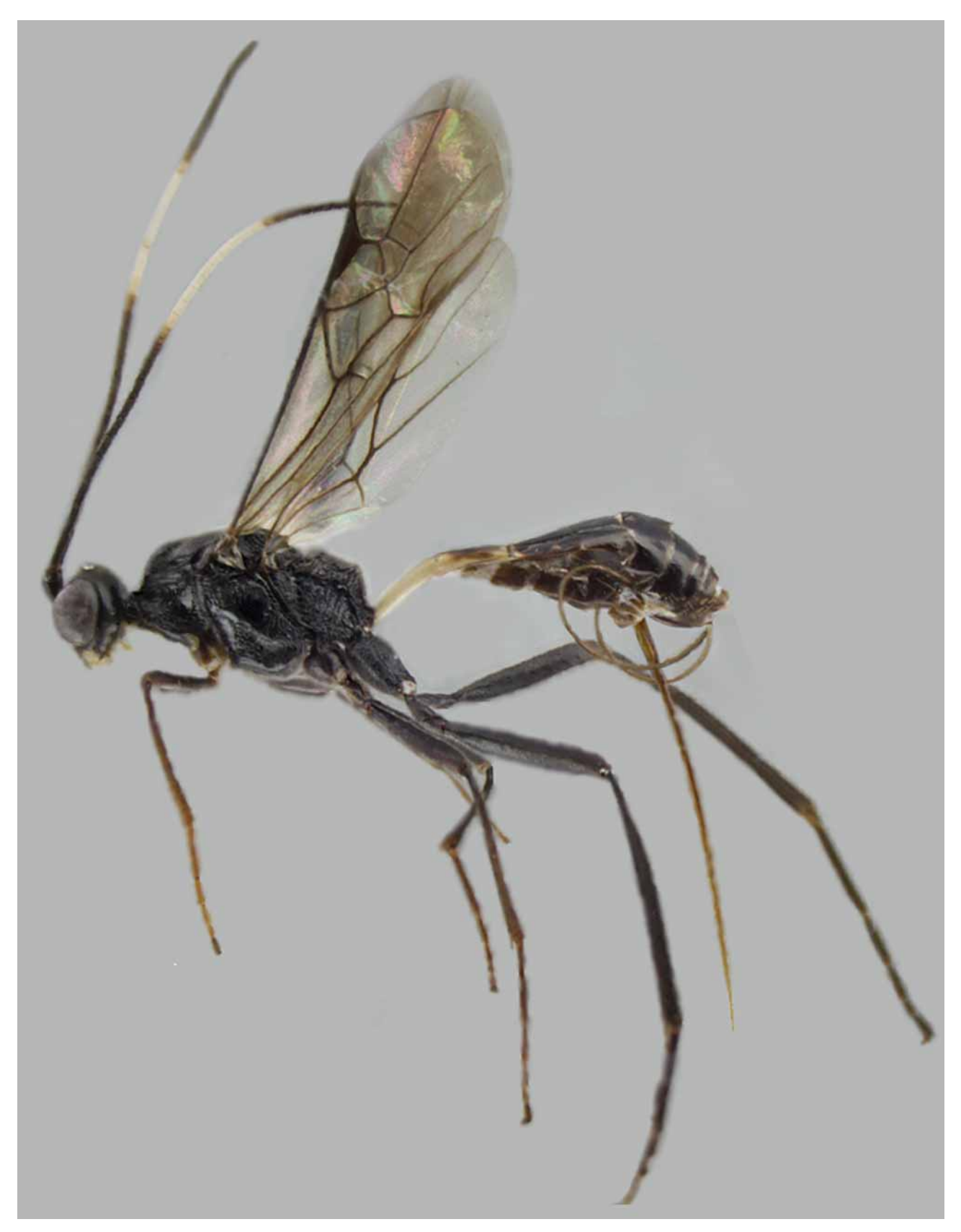
FIGURE 1. Lateral habitus of Meteorus gigas sp.nov.

Metasoma . First metasomal tergite without dorsopes; ventral borders of first tergite separated basally, joined apically; first tergite dorsally smooth; ovipositor long, thick at base, 3.33 x longer than first tergite.