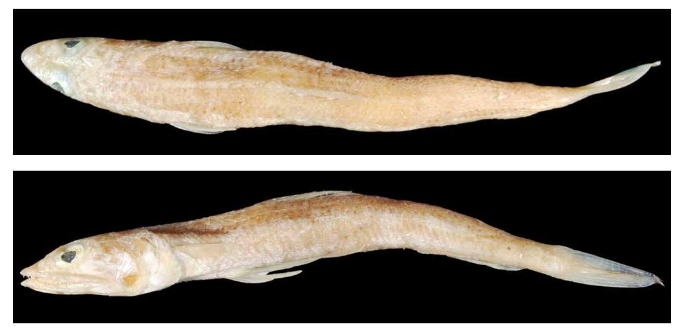
FIGURE 2. Holotype of Synodus vityazi sp. nov., USNM 307924, 99.0 mm SL. A. Dorsal view. B. Lateral view.