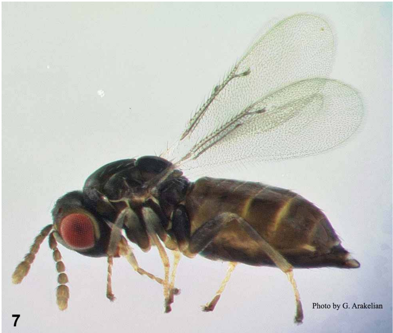
FIGURE 7. Selitrichodes globulus ♀. Habitus.

Head (Figs 8–9). Ocellar triangle without grooves; sometimes grooves can be seen only on a shrunken specimen. POL about 3 times as long as OOL. Frontal suture transverse, short, not connected medially and curving ventrally, well separated from eye margin, placed ventral to median ocellus, separated from median ocellus by 1.5–2.0 times its diameter. Scrobal area without distinct median carina; with a small transverse cracklike suture present about halfway between frontal suture and torulus. Torulus level with ventral margin of eye. A broad depression (supraclypeal area) below torulus extending to clypeus and with some pilosity. Gena swollen and with malar sulcus somewhat curved near mouth margin. Clypeal margin bidentate.