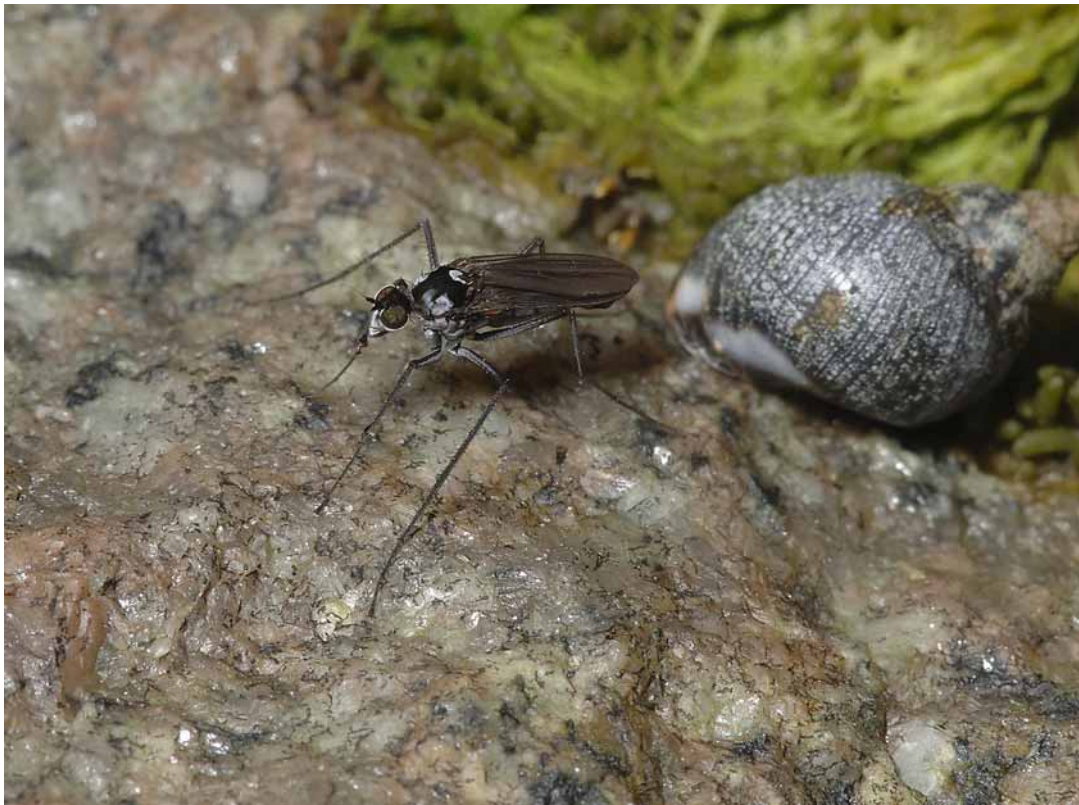
FIGURE 1. Male Thambemyia borealis (Takagi) resting on intertidal rock at Miraflores, Peru.