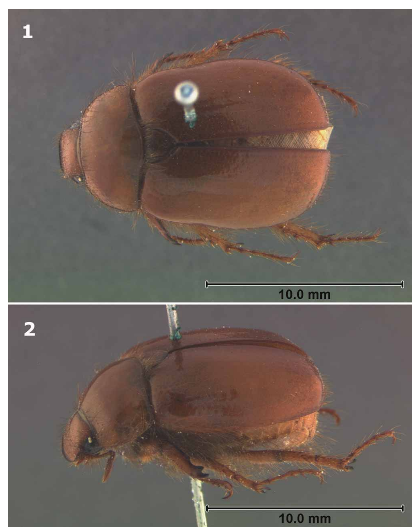
FIGURE 1, 2. Platycoelia cochabambensis. 1, dorsal habitus; 2, lateral habitus.

antennomeres; pronotum touching eyes, sparsely setose; elytral apices not capable of completely covering the pygidium; apex of the elytral suture without an acute spine; mesothoracic process reduced to nub; apical abdominal spiracle not protuberant; mesotarsomere 5 and metatarsomere 5 without an internal tooth; parameres with the apex rounded, not expanded.