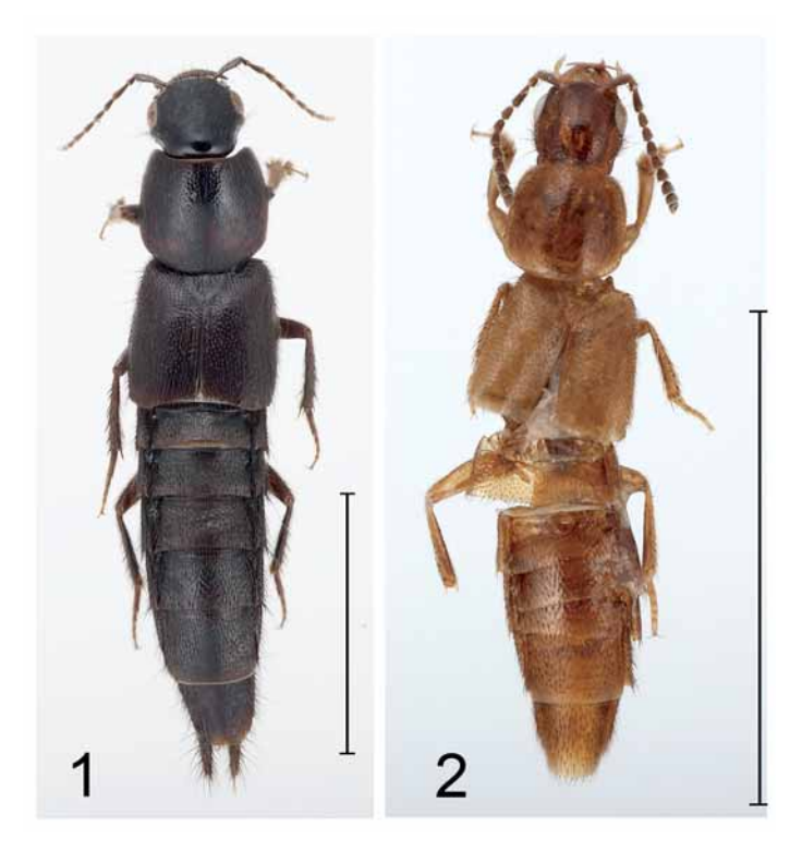
FIGURES 1–2. Australotarsius grandis (1) and A. tasmanicus (2), habitus. Scale bar 5 mm.

Etymology. The genus name is derived from two words "Australia" and "tarsus". It refers to the country of origin and spectacular wide anterior tarsi of this new taxon. It is Latinized noun of masculine gender.