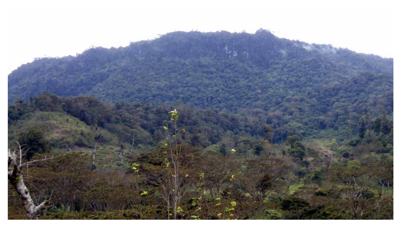
FIGURE 4. Montaña de Santa Bárbara, Depto. Santa Bárbara, Honduras, seen from the community of El Cedral, 1580 m elevation, in the vicinity of the type locality of Typhlops tycherus . The highest part of the mountain is >2700 m elevation.

Etymology. The specific name tycherus is derived from the Greek word "tycheros," meaning "lucky," and is given in reference to a remarkable string of providential events that preceded the acquisition of the holo-type.