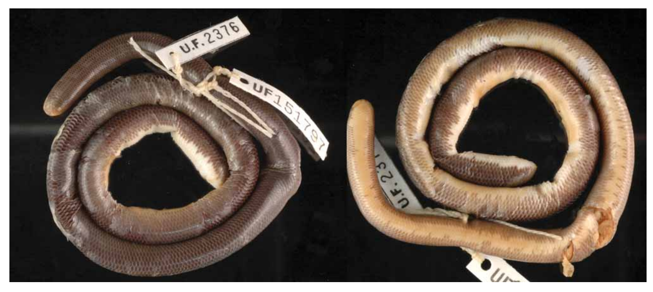
FIGURE 3. Dorsal and ventral aspects of the preserved holotype of Typhlops tycherus .

bital distance 4.2 mm, 66.7% of head width; parietals 2/2, anterior parietals cycloid, bordered posteriorly by second pair of wide, narrow occipitals; occipitals spanning about two dorsal scales; frontal contacted at posterior apex by two small scales that interrupt contact between occipitals; 4/4 supralabials, becoming large posteriorly; second and third supralabials contacting preocular; supralabial imbrication pattern T-III; preoculars about twice as high as wide, contacting anterior edge of eye spot; ocular about twice as high as wide at maximum; mental small, roughly equal in size to adjacent infralabials and chin scales; infralabials 4/4, roughly equivalent in size to each other and adjacent scales.