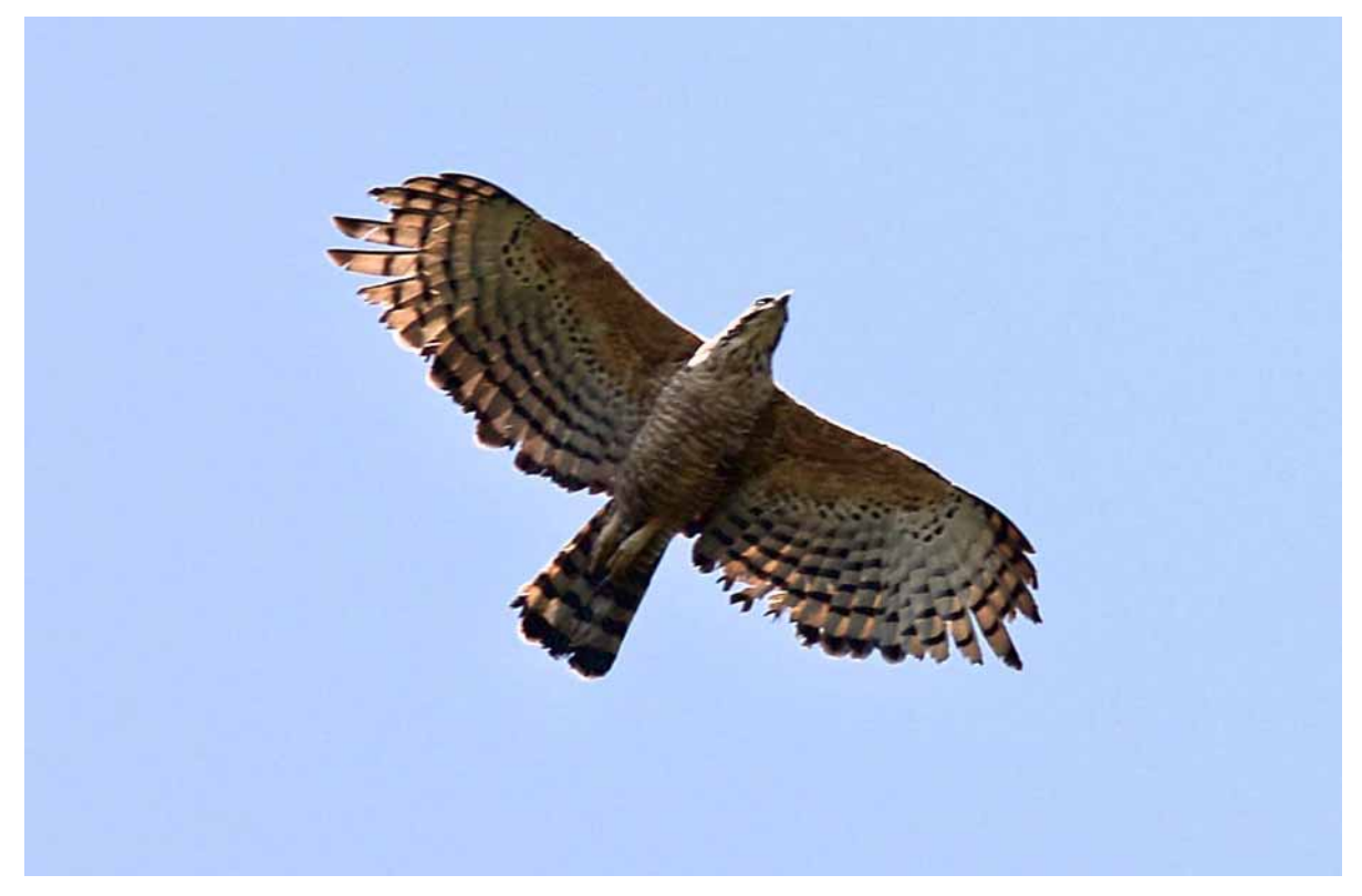
FIGURE 5. Adult Nisaetus kelaarti photographed in Sri Lanka.