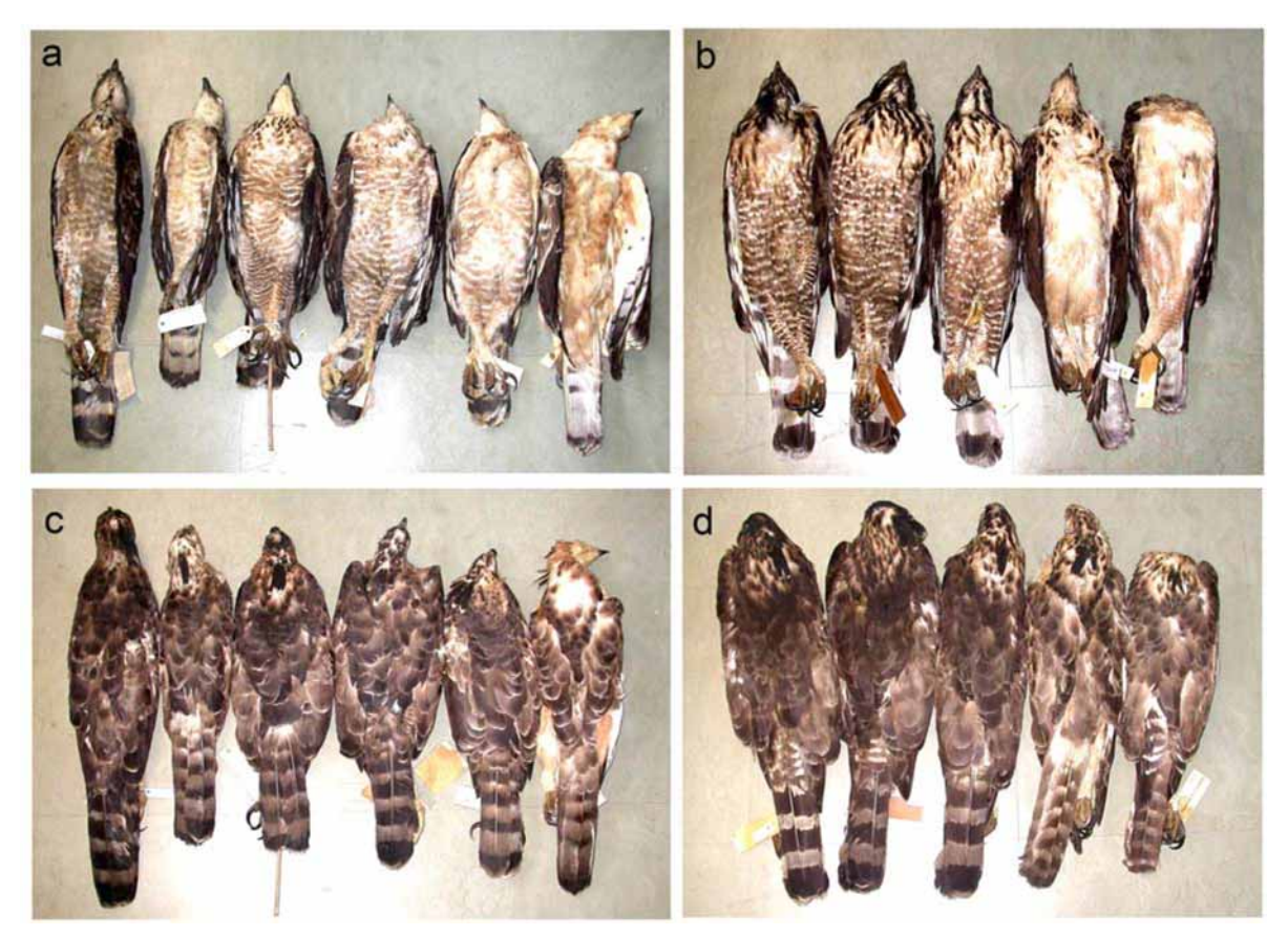
FIGURE 3. BMNH specimens in ventral view: (a) Nisaetus kelaarti , adult on left, four immatures in middle, juvenile on right; (b) Nisaetus nipalensis , three adults on left, two juveniles on right. Same specimens on dorsal view: (c) N. kelaarti ; (d) N. nipalensis .

As shown in Fig. 2f and g, the vocalizations of the Japanese subspecies N. n. orientalis are yet again somewhat different from either of the above. However, given that those of Fig. 2g are from a juvenile, and that the context is unknown for that in Fig. 2f, further recordings are needed to interpret the significance of these apparent differences. Inoue Takehiko (in litt. to JOG) described the vocalizations of adult N. n. orientalis as lower and longer than those of N. n. nipalensis , sounding like " Bu-Bu , Bu-Bu " when the birds are being cautious, as when they are near their nest site.