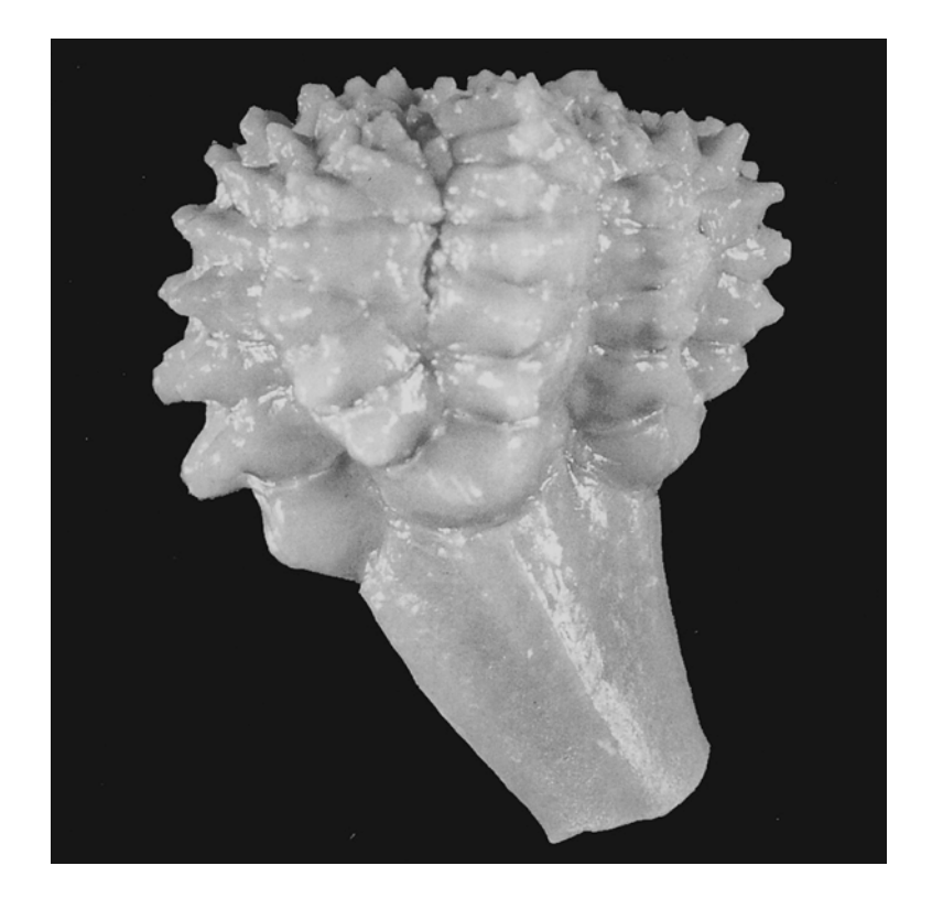
FIGURE 1. Holopus mikihe new species, holotype, USNM E41507, A-ray central (after Donovan, 1992, figure 1.2). Crown about 33 mm high.