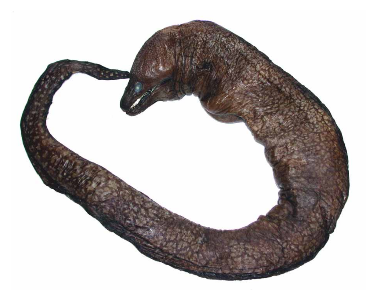
FIGURE 1. Gymnothorax baranesi, holotype, 857 mm TL, HUJ 18976.

Diagnosis . A moderately large moray of the subfamily Muraeninae with a color pattern of irregular, complex, rosette-like pale spots on a brown background, the spots becoming smaller on head. Intermaxillary teeth in one peripheral and one median row. Maxillary teeth in 1–2 rows, the inner row, when present, consisting of only two depressible teeth. Mandibular teeth in one row. Vertebrae 6–7, 52–55, 137–142.