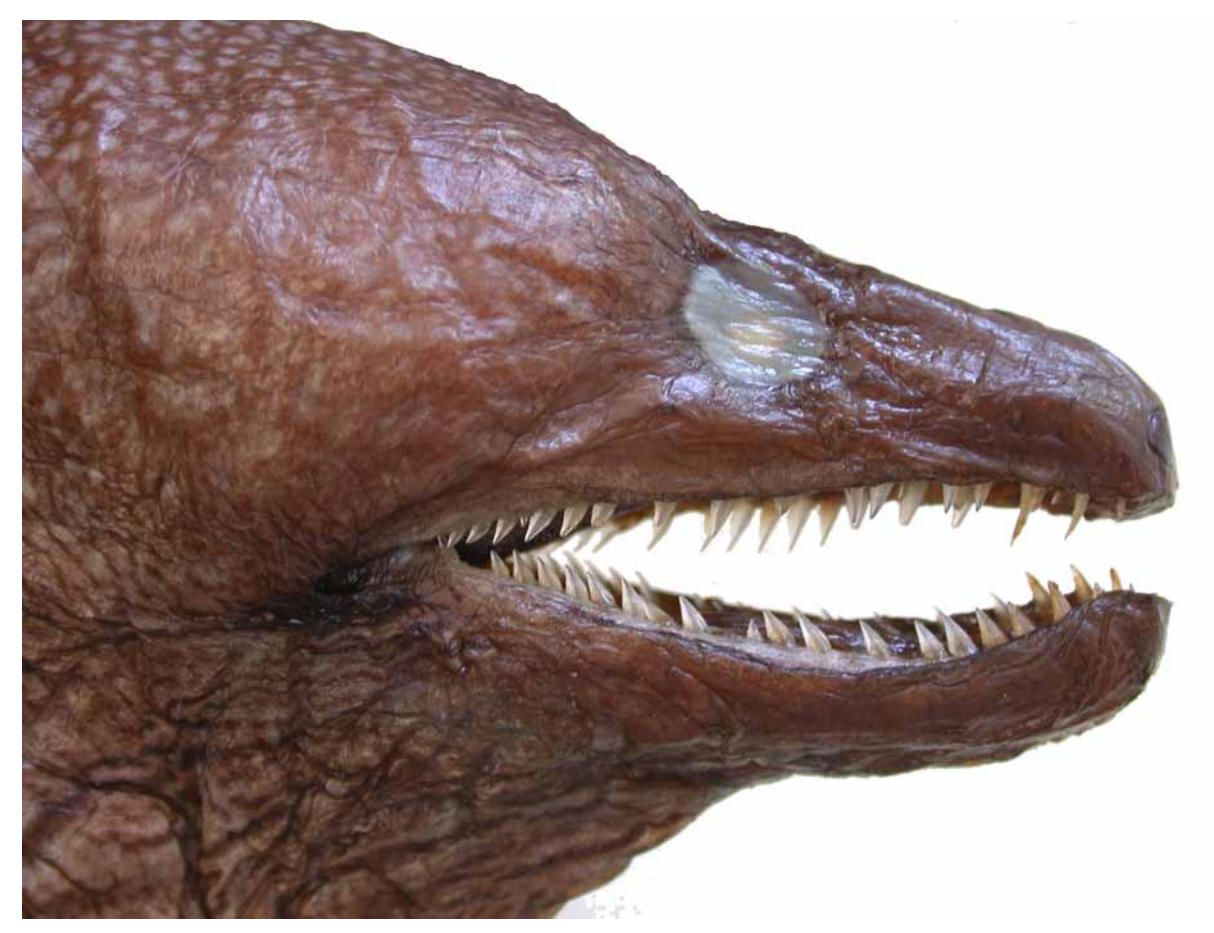
FIGURE 2. Head of holotype.

between anterior nostril and eye, and one just anterior to a vertical through posterior margin of eye; two pores at anterior end of lateral-line canal, anterodorsal to gill opening.