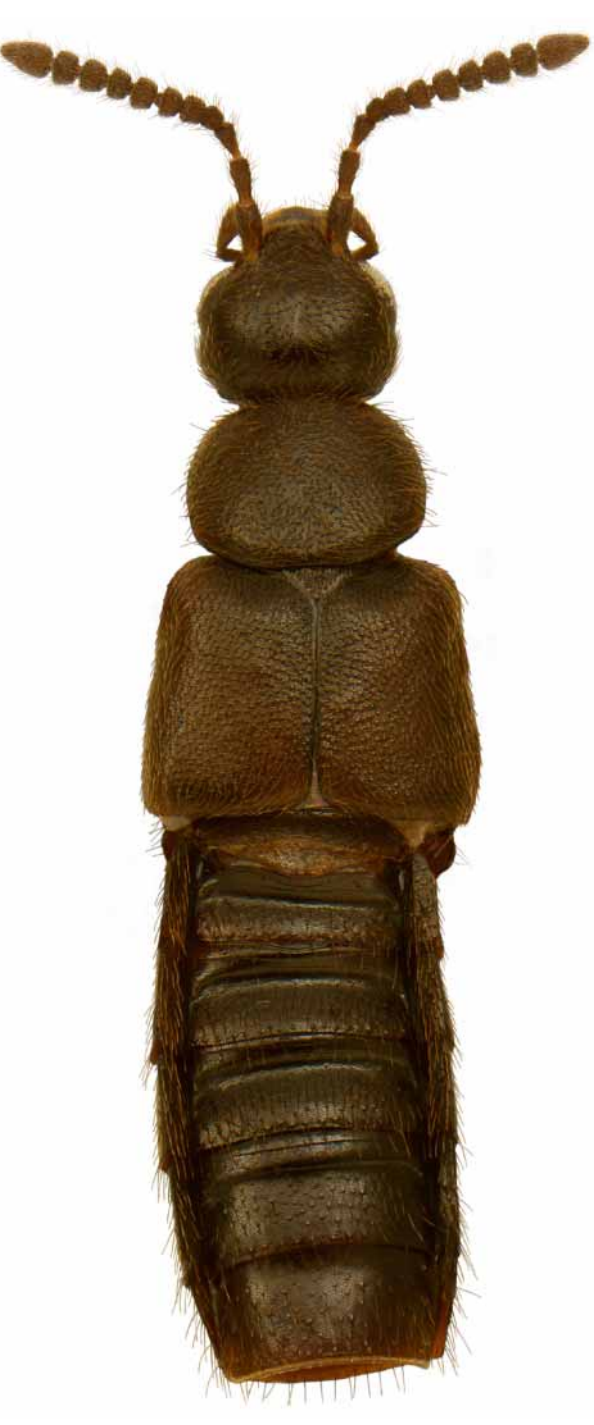
FIGURE 6. Habitus photograph of Atheta irrita Casey.

two different host species at sites that are circa 130 kilometers apart, on both the mainland and Cape Breton Island, also suggesting that this species may be widely distributed in Nova Scotia in suitable habitats.