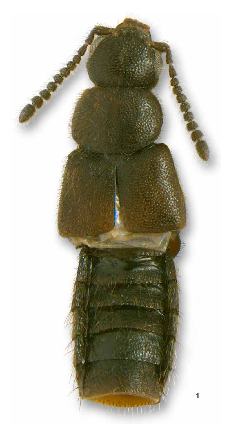
FIGURE 1. Habitus photograph of Atheta (Datomicra) celata (Erichson).

infraspecific variation. Therefore, we regard all these specimens as belonging to the same species of A. celata and consequently regard A. wrangeli (Casey) syn. nov. as a synonym of A. celata (Erichson 1837).