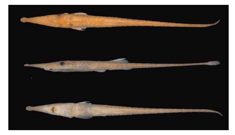
FIGURE 1. Acestridium colombiensis INHS 99093, paratype, 45.7 mm SL, dorsal, lateral, and ventral views.

Outer portion of the upper lip is lightly pigmented and the inner portion is unpigmented. The lower inner lip is unpigmented and the outer side has a few dark melanophores.