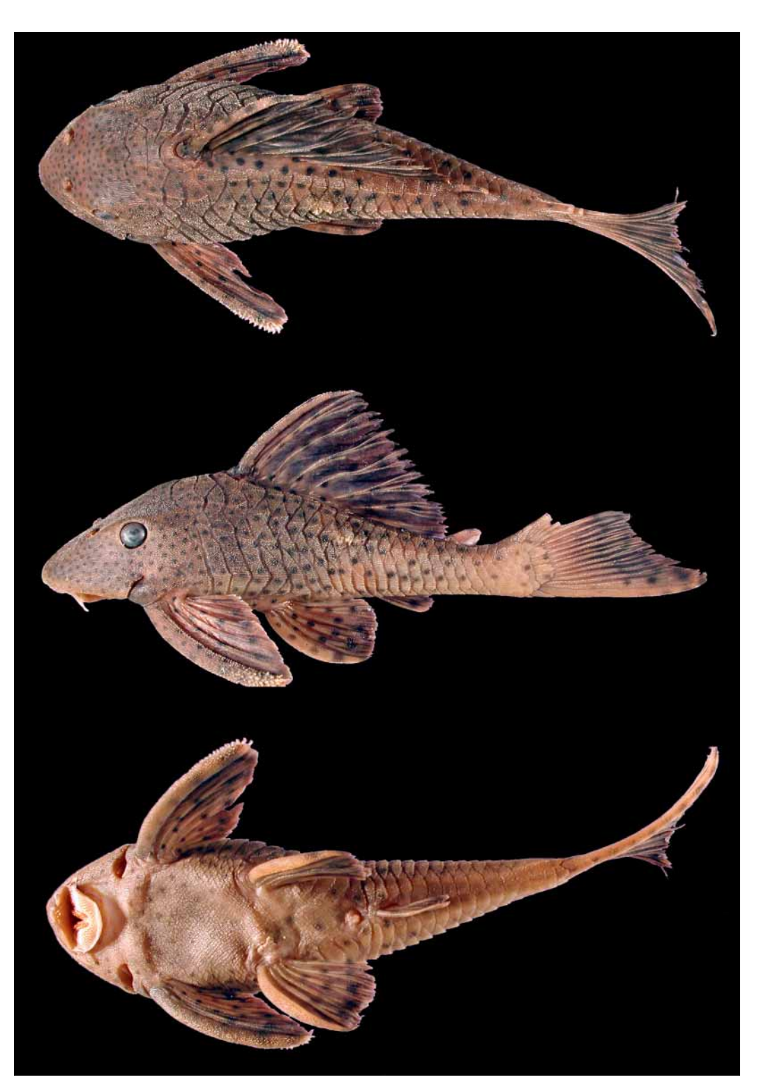
FIGURE 1. Dorsal, lateral, and ventral views of the holotype of Hypostomus macushi , UG/CSBD 11047, 130.9 mm SL.