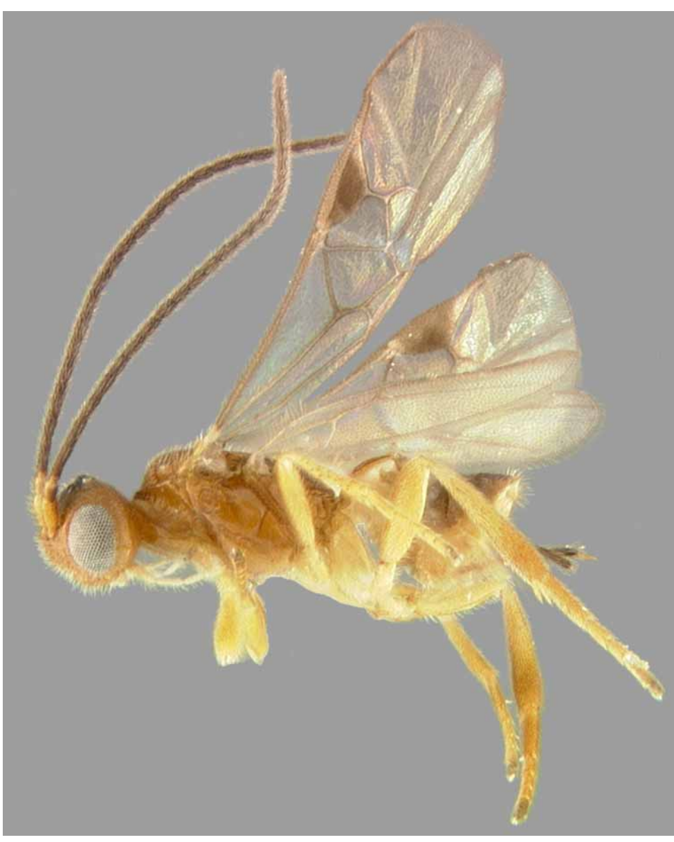
FIGURE 2. Habitus of holotype female Epsilogaster fullertoni, lateral view.