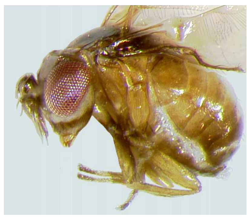
FIGURE 1. Pachamama speciosa, habitus (<sup>2</sup> from Ecuador: Napo: Reserva Etnica Waorani).

anterior to retinaculum; venation sigmoid, with SC, PM, MV, & SV all confluent; radial process absent; PM with two setae and a single campaniform sensillum at apex; PM curving precipitously up to wing margin and, with SC, delimiting a large costal cell; MV elongate; SV not constricted at base, relatively straight, diverging only slightly from margin of wing. Hind wing broad and subtriangular, with widest point at hamuli; anterior margin broadly V-shaped in basal half. Male genitalia as in Trichogrammatini (Viggiani 1971, 1984); aedeagus separate from genital capsule; genital capsule presumably open dorsally; parameres and volsellae present, intervolsellar process absent.