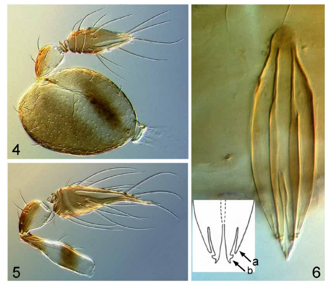
FIGURES 4–6. Pachamama speciosa . 4, \sigma antenna. 5, \varphi antenna. 6, male genitalia [detail of apex of genital capsule at left; arrows to paramere (a) and volsellar spines (b)].

Antenna with scape extremely enlarged, suboval, ca. 1.5 x as long as wide, subequal to length of remainder of antenna; club conical and symmetrical; relative length of scape: pedicel: club = 3:1:2; C3 2–3 x as long as C1 and C2 combined. C1 with 1 APB and 0–1 BPS; C2 with 1 APB, 0–2 APA, and 2 BPS; C3 with 3 APB in basal half, 1–2 APA, 3 BPS, 4–5 FS, and 3 PLS parallel to longitudinal axis of segment. Forewing with relative length of PM: MV: SV = 4:5:1. Genital capsule widest at middle, sides tapering gradually to apex, and more abruptly and unevenly to base; genital capsule and aedeagus including apodemes subequal, together ca. 0.6–0.7 x hind tibial length; apodemes ca. 0.2 x genitalia length and restricted to basal 1/3 of capsule.