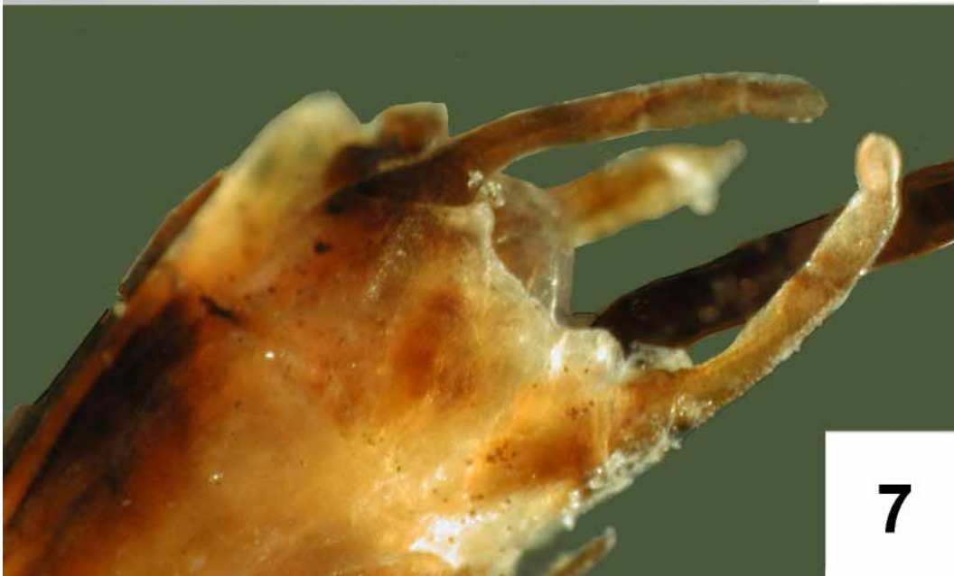
FIGURES 6–7 , Siphonurus davidi , photographs: 6, pinned specimen; 7, genitalia (cleared), ventral view.