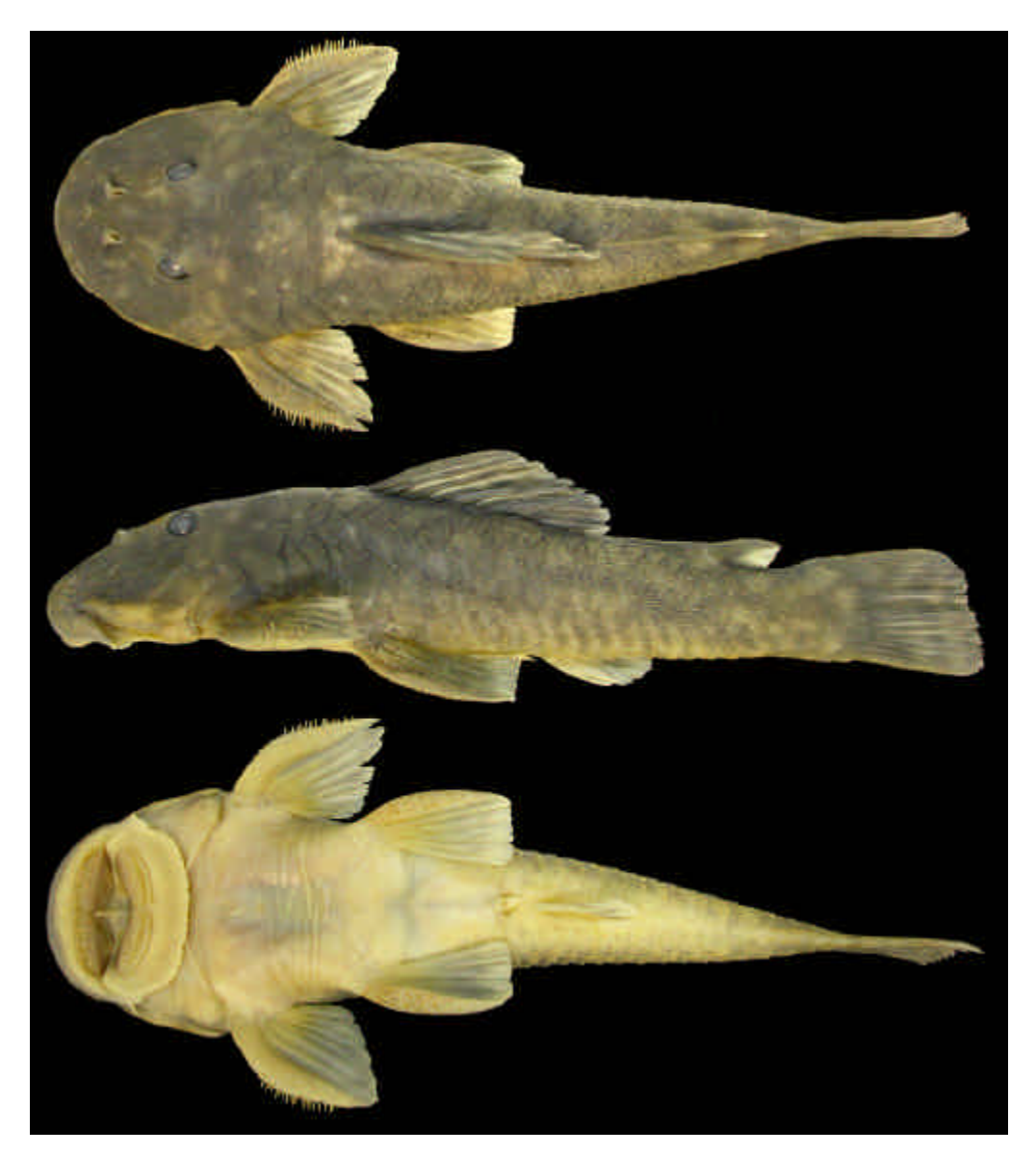
FIGURE 1 . Hemipsilichthys nimius , holotype, MCP 33049, 105.1 mm SL, male; Brazil: Rio de Janeiro: Parati: rio Carrasquinho below Cachoeira do Tobogã, upper rio Perequê-Açu.

Holotype . MCP 33049, male, 105.1 mm SL; Brazil: Rio de Janeiro: Parati: rio Carrasquinho below the Cachoeira do Tobogã, upper Perequê-Açu basin, Penha, ca. 7.5 km West of highway BR101, on road from Parati to Cunha (23°12'51"S 44°47'28"W), 1 Feb 2003, E. H. L. Pereira, R. E. Reis & F. Fernandes.