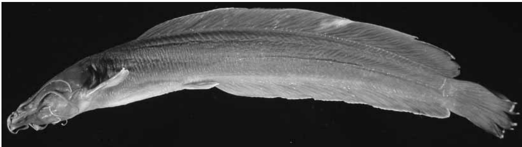
FIGURE 1. Clarias insolitus , holotype, MZB 6112, 122.5 mm SL; Borneo: Barito River drainage.

Paratypes: BMNH 2001.1.15.98–103, 7 ex., 53.5–139.7 mm SL; data as for holotype.