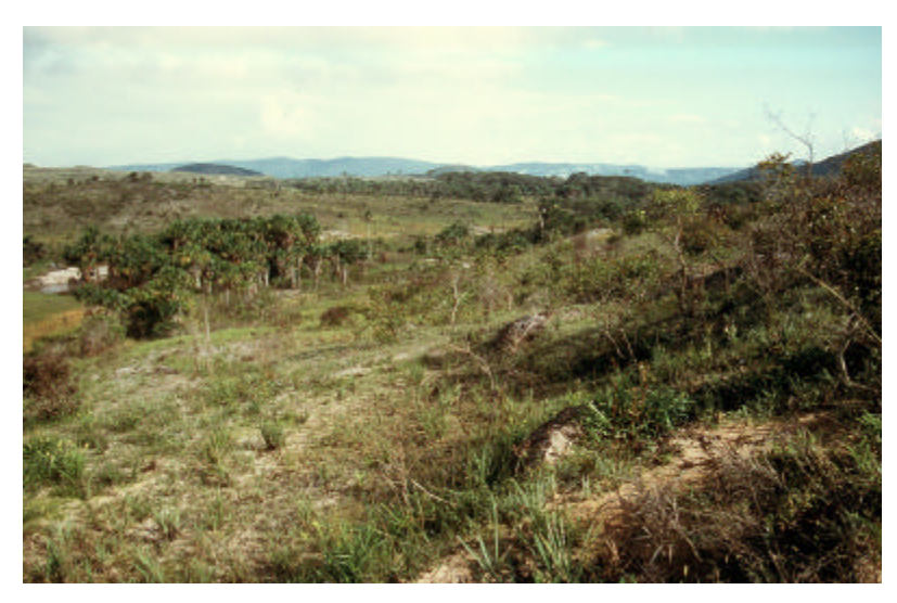
FIGURE 5. Type locality of Cylindromorphoides katrinae sp. n.

Venezuela, Gran Sabana. Known only from the type locality (Fig. 5).