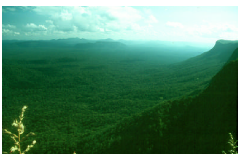
FIGURE 6. The valley of the "Rio Icabaru".