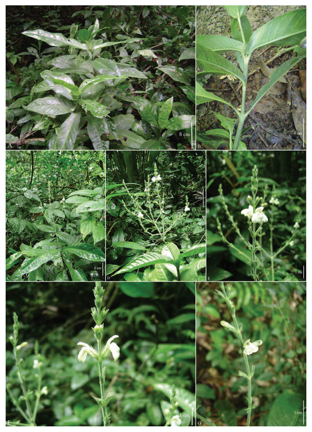
FIGURE 1. Justicia paracambi in the Parque Natural Municipal do Curió (Curió Municipal Natural Park), Paracambi, RJ, Brazil: a) Sterile individuals; b) Stem and leaves; c) Flowering plant; d) Terminal inflorescence showing decussate spikes and flowers; e) Inflorescence with decussate flowers; f) Flowers in lateral view; g) Flower in frontal view.

slightly asymmetric, lower thecae appendiculate at base, appendage 3-lobed, 0.6–0.8 mm long, whitish, swollen; pollen 2-colporate, prolate, 21– 28 \times 15 – 20 \mu m , 2 narrow ribs associated with each aperture, not joining the others at the poles, exine reticulate; nectariferous disk expanded, 0.3–0.5 mm tall, ovary subcylindrical, 1.5–2.5 mm long., 0.6–0.8 mm diam., glabrous, style ca. 5.1 mm long, base with scattered glandulous trichomes. Capsule subclavate to subfusiform, 8.2–11.8 mm long, 1.1–1.7 mm diam., densely glandular pilose, seeds lenticular, 1.7–1.9 \times 0.8–1 mm, tuberculate over entire surface.