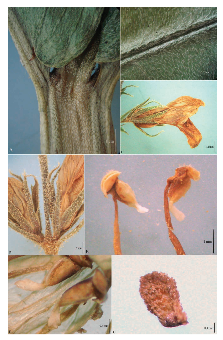
FIGURE 2. Justicia paracambi : a) Cystoliths in the stem; b) Cystoliths in the middle vein of the upper leaf surface; c) Bract, bracteoles, calyx and glabrous corolla; d) Rachis, bracts, bracteoles and calyx with dense glandular and non-glandular trichomes; e) A pair of the bithecae anthers; f) The basal appendage of the anthers in detail; g) Seed with tuberculate surface.

Distribuition and habit: —The new species is so far known only from the type locality, the Parque Natural Municipal do Curió , Municipality of Paracambi, in the southern part of Rio de Janeiro State, Brazil. It grows in dense forest and especially near watercourses at low altitudes.