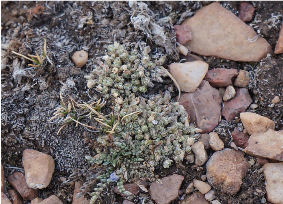
FIGURE 2. Habit of Arenaria acaulis (along road between Matazo and Querala, Ubinas district, at 4584 m).

Taxonomical notes: —The new species is unique among the Neotropical Arenaria because of its dense cover of trichomes and the tufted, cushion-like habit. A. acaulis most closely resembles A. boliviana (Williams 1898: 425) MacBride (1936: 597–598). It differs by its shorter stem and internode length, the short branches being ciliate; the leaves ovate and densely covered by long trichomes; pedicels shorter or equal to the size of the calyx, sepals broadly ovate and densely covered with trichomes, and by the presence of petals.