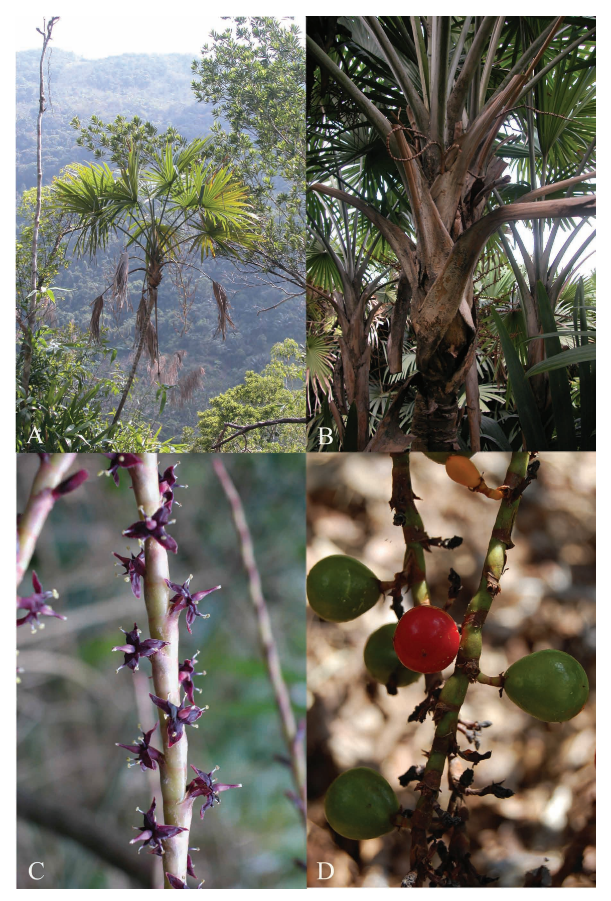
FIGURE 1. Chuniophoenix hainanensis. A. Habit, Diao Luo Shan, Hainan ( Guo et al. 142 ). B. Leaf sheaths showing split below petiole (cultivated, South China Botanical Garden). C. Staminate flowers, Diao Luo Shan, Hainan ( Guo et al. 142 ). D. Fruits (cultivated, Singapore Botanical Garden).