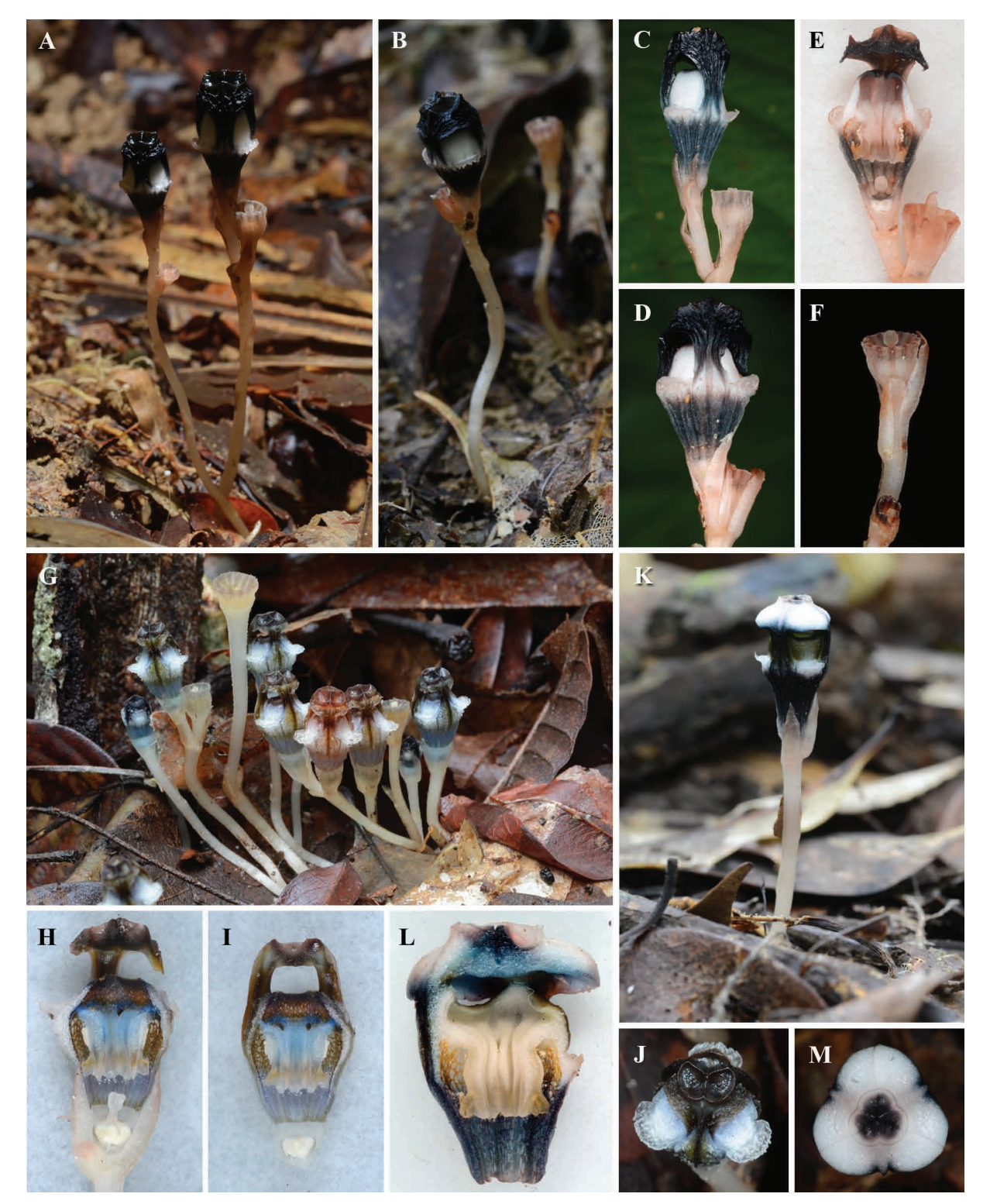
FIGURE 2. A–F. Thismia nigricans Chantanaorr. & Sridith: A–B. Habit, C–D. Flowers, E. Longitudinal section of flower, F. Fruit. G–J. T. angustimitra Chantanaorr.: G. Habit, H–I. Longitudinal section of flowers, J. Top view of mitre. K–M. T. mirabilis K. Larsen: K. Habit, L. Longitudinal section of flower, M. Top view of mitre.

Small terrestrial, achlorophyllous, mycotrophic herbs. Underground parts clustered, creeping, vermiform, branched, brownish-white tip, to 1.5 mm in diameter. Stem erect, simple, whitish, to 11 cm tall, 2.2–2.8 mm in diameter, glabrous, terete. Leaves glabrous, appressed, narrowly triangular with acute apex, scale-like, 2–8.5 mm long, 1.2–2.2 mm wide, leaves increase in size up to the apex of the plant where they are equivalent to floral bracts. Involucral bracts 3, white, similar to upper leaves. Flowers solitary or paired, developing sequentially with only one anthetic. Perianth actinomorphic with 6 tepals fused to form a perianth tube with a foveate mitre. Perianth tube bluish brown or blackish