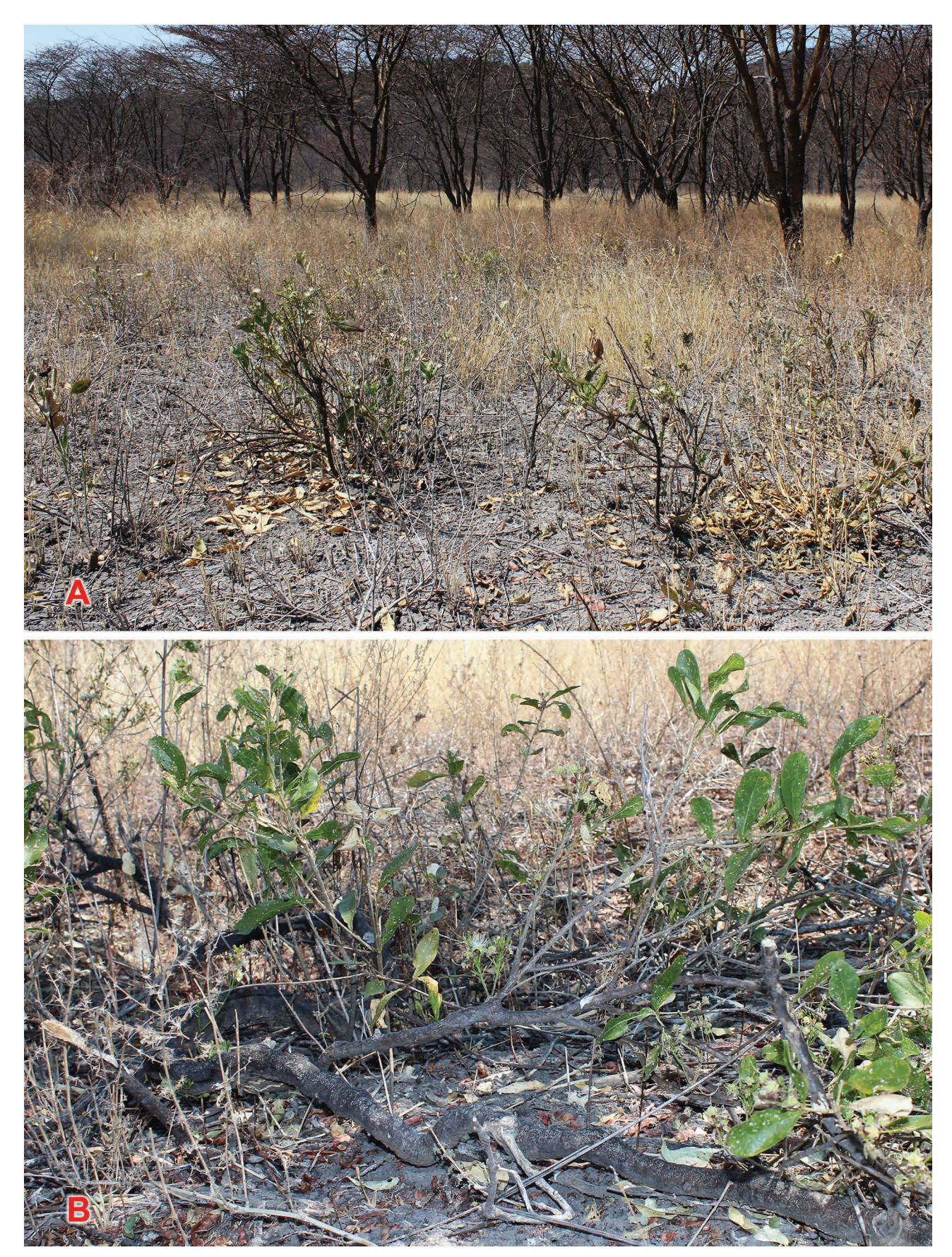
FIGURE 1. M. sebrabergensis in its natural habitat. A, clonal growth with several ramets in foreground, showing ascending shoots, \pm 0.7 m tall; trees in background are Acacia kirkii Oliver (1871: 350). B, suffrutex showing flood-exposed runner.