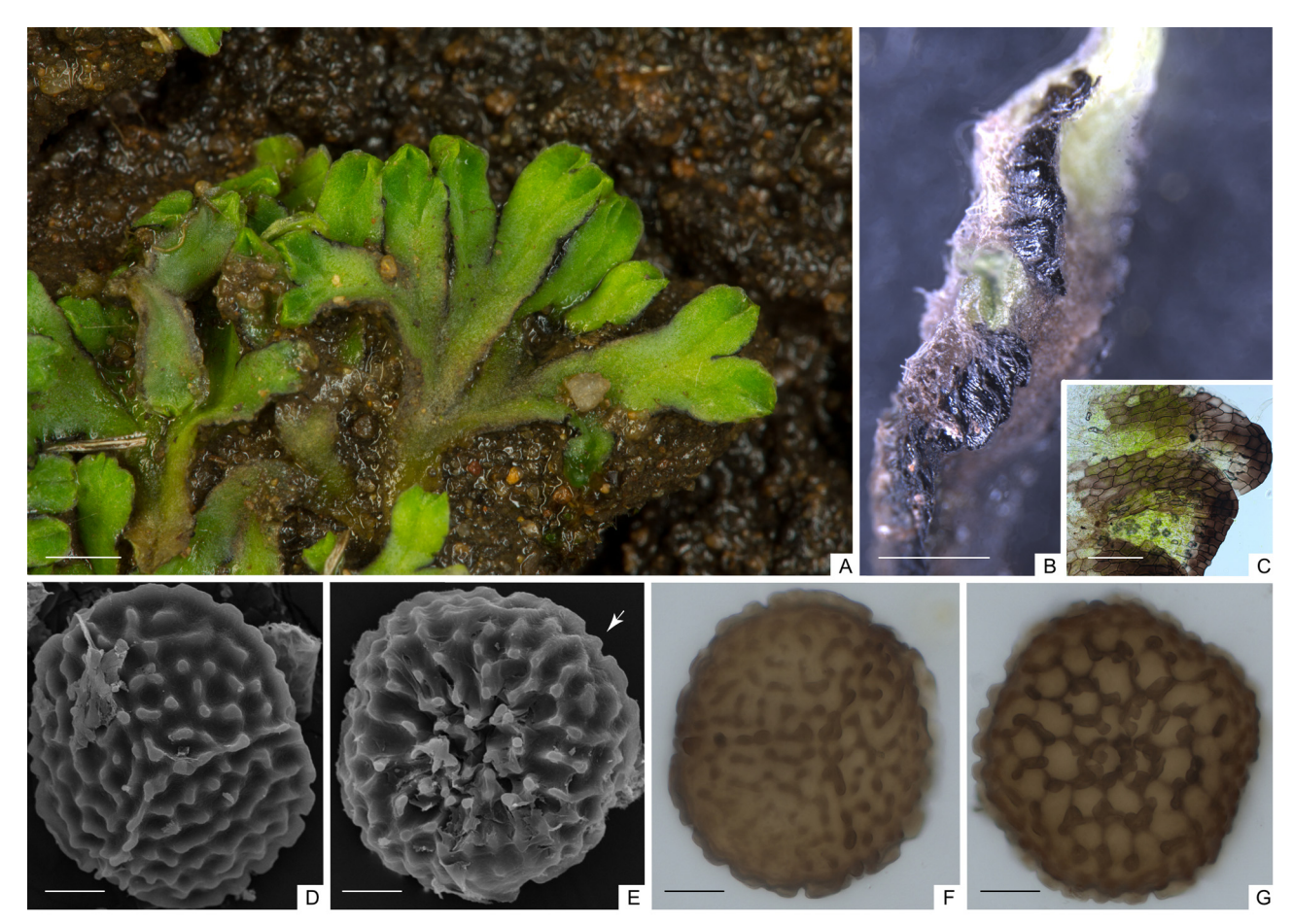
FIGURE 1. A. Habit of Riccia boliviensis ; B. Black ventral scales; C. Detail of scales; D–E. SEM micrographs of spores. D. Proximal face; E. Distal face, with details of crenulated margin (arrow); F–G. Light microscopy micrographs. F. Proximal face, with detail of sinuose ridges surface; G. Distal face with tuberculate areolate ornamentation. Bars: A=2 mm; B–C=1 mm; D–G=20 μm.

Thallus medium-sized, lobes 6–8 mm long, 2–3 times dichotomous, rounded apically; in gregarious patches or crowded stands; margins smooth, without papillae and cilia, inflexed; in cross section, lobes up to 1.9 mm wide, 3 times wider than high (0.6 mm high), flanks ascending, tissue cells thin walled and idioblasts absent; ventral scales black, glossy, extending beyond margins, sometimes bordered by small hyaline cells; spores tetrahedral, 95–107 µm diameter, orange-brown, wing 5–6 µm wide, margin strongly crenulate, distal surface areolated with tubercles in angles, proximal surface with sinuose ridges and triradiate mark.