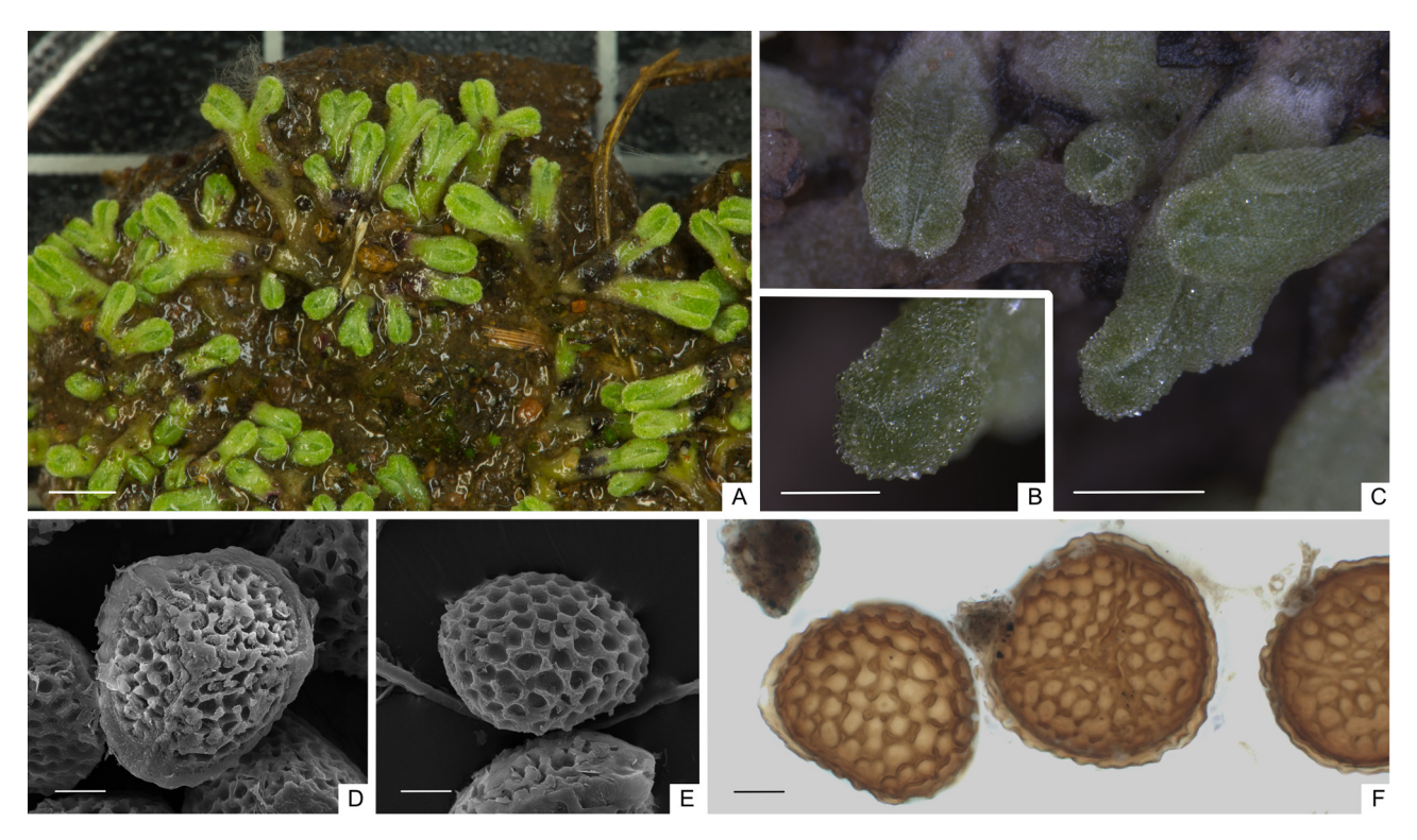
FIGURE 2. A. Habit of Riccia iodocheila ; B. Light microscopy photo of papillae at apex of thallus; C. Papillae on margins of thallus; D–E. SEM micrographs of spores D. Proximal face; E. Distal face with detail of areolate ornamentation; F. Light microscopy micrographs of spores, (left) distal face with detail of triangular tubercles, and (right) proximal face, with detail of weak trirradiate scar and crenulated margins. Bars: A=2 mm; B=500 \text{ } \mu\text{m} ; C=1 mm; D-F=20 \text{ } \mu\text{m} .

Thallus small-sized, lobes 3–4 mm long, 2–3 times dichotomous; in hemirosettes or gregarious patches; rounded apically, medium groove shallow, apex with papillae and margins pink with few papillae; in cross section, lobes up to 0.56–0.59 mm wide, 2 times wider than high (0.28–0.31 mm high), flanks violet ascending vertically; ventral scales small, violet, of few cells, projecting marginal cells; spores tetrahedral, 90–104 µm diameter, dark brown, wingless, sometimes show vestigial wing margins finely crenulated, distal surface areolated with tubercles, proximal surface areolated with tubercles and trirradiate mark.