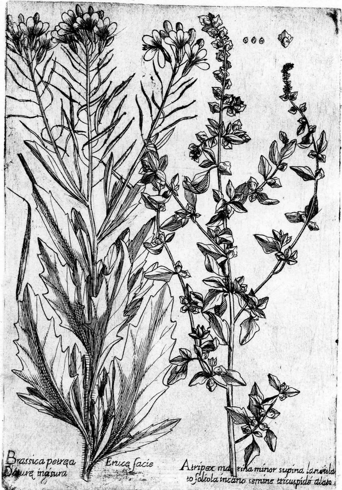
FIGURE 1. Lectotype of the name Atriplex tornabenei ( Atriplex marina minor supina lanceolata foliola incano semine tricuspidē alata , T. III from Cupani 1713).