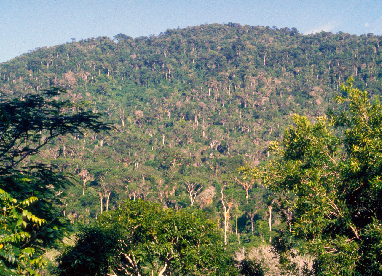
FIGURE 3. Forested slope of the Serra do Teimoso Private Reserve (RPPN), Jussari, Bahia.

The only other species with achenes similar in size to those of Pleurostachys arcuata is P. macrantha Kunth with achenes 2.8–3.4 × 2.7–3.2 mm. Pleurostachys macrantha , however, has large, open panicles with solitary spikelets at the end of each branch. The remaining species of Pleurostachys have achenes approximately 1 mm long or less.