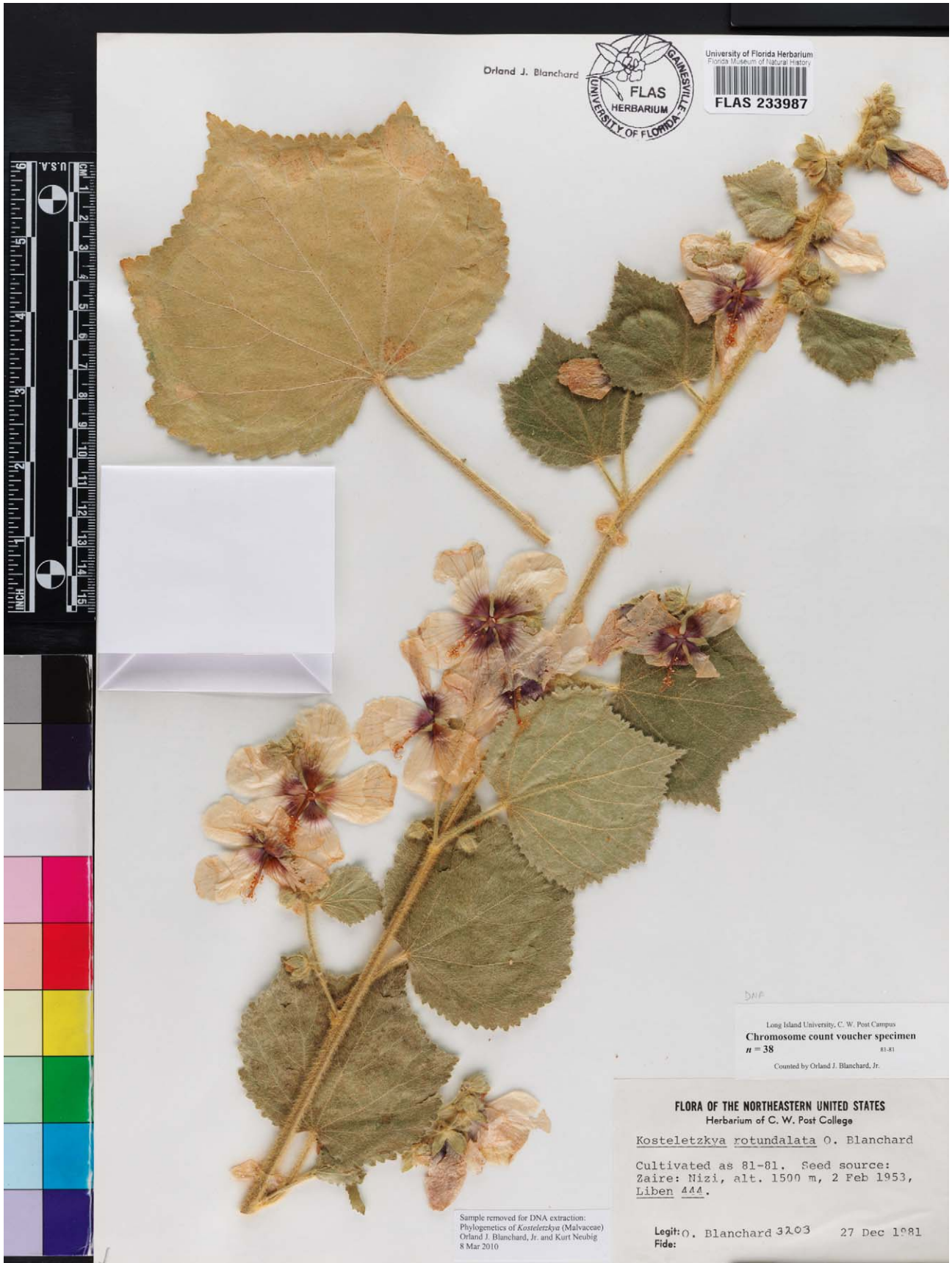
FIGURE 1. Herbarium specimen (a paratype) of a cultivated plant of Kosteletzkya rotundalata O. J. Blanch., sp. nov. Blanchard 3203 (FLAS).