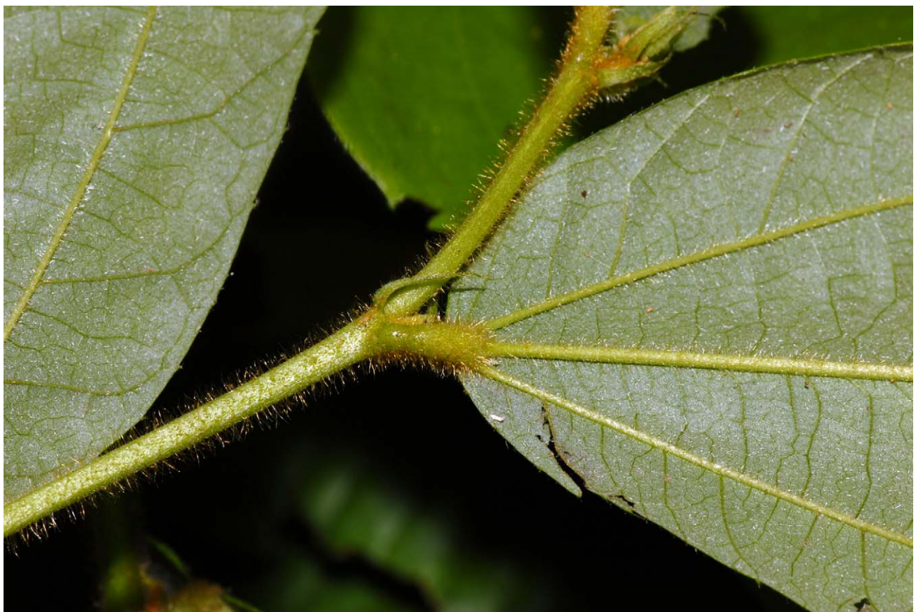
FIGURE 1. Duboscia macrocarpa . The short, stout petiole and long, straight hairs on the petiole and stem can be clearly seen.