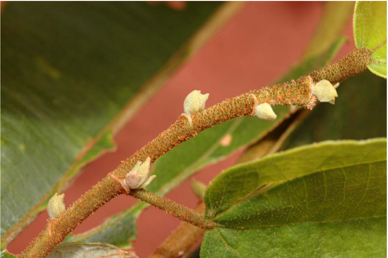
FIGURE 3. Duboscia viridiflora , with longer petiole and short, stellate hairs on the petiole.