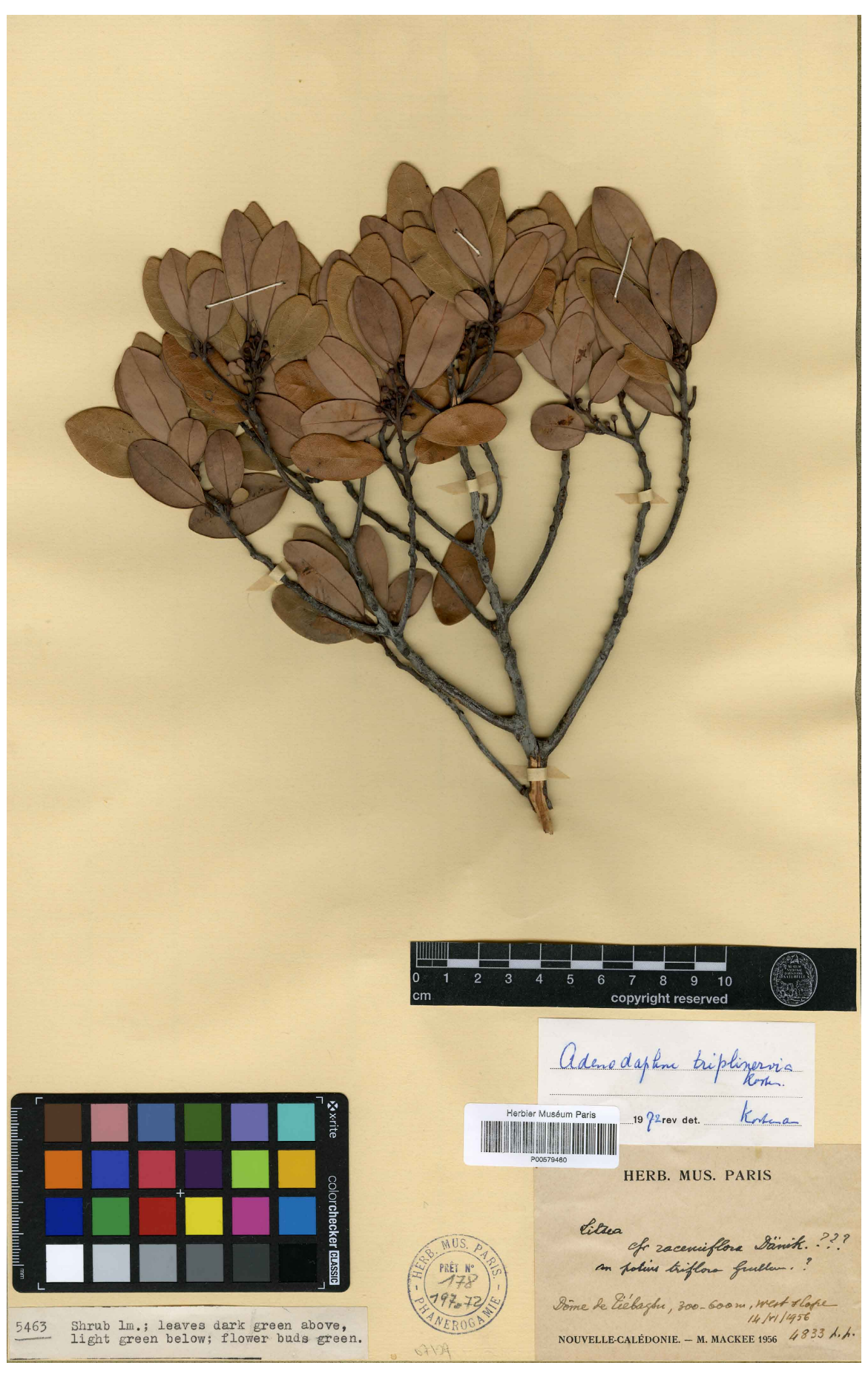
FIGURE. 3. Unique specimen found in P bearing the number 5463. Two labels appear on it, the lower-right one with the number 4833, and the lower-left one with the number 5463.