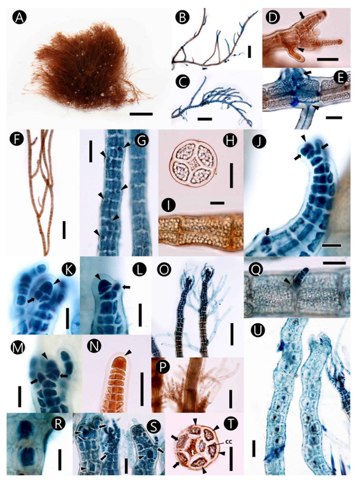
FIGURE 2. Polysiphonia scopulorum Harvey. A: Tetrasporophyte (Rottnest Island, Australia; 11 November 2015); B & C: Prostrate axes and numerous erect axes; D: Unicellular rhizoid in open connection (arrowhead) with a pericentral cell and apex of prostrate axes (arrow); E: Unicellular rhizoid in open connection (arrowhead) with pericentral cell and erect axes (arrow); F: Irregular branching pattern; G: Scar cells on erect axes; H: Cross-section of erect axes; I: Discoid rhodoplasts in pericentral cells; J: Apical cell (arrowhead) and endogenous branching (arrows) in erect axes; K–M: Apical cell (arrowhead) and exogenous branching (arrows) in erect axes; N: Apex of erect axes (arrowhead: apical cell); O & P: Trichoblast; Q: Adventitious branch (arrowhead); R: Tetrahedrally divided tetrasporangia; S: Tetrasporangia (arrowheads) and trichoblast or scar cells (arrows); T: Cross-section of tetrasporangial branch (arrowheads: pericentral cells, arrows: presporangial cover cells, t: tetrasporangium, cc: central cell); U: Slightly spiral arrangement of tetrasporangial series (Scale bars: A = 5 mm, B, C, F = 500 µm; D, E, H, I, Q, R, S, T = 50 µm; G, P, U = 100 µm; J–M = 20 µm; N = 30 µm; O = 200 µm).