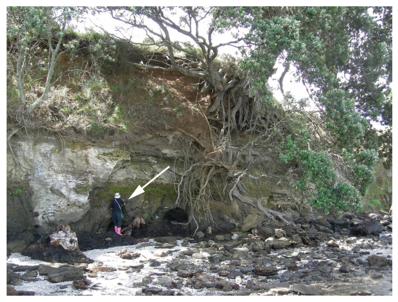
FIGURE 1. Type locality of Didymodon novae-zelandiae on Manukau Harbour foreshore. D. novae-zelandiae (position arrowed) on the cliff face, below a denser band of vegetation (mainly Bryum clavatum ), some 1.5 m above high tide mark. The remains of trunks of trees buried by eruption of nearby Maungataketake can be seen in the cliff base both to the right and left of the standing figure. The large pohutukawa tree ( Metrosideros excelsa ) to the right, above, has now fallen from the cliff. Photo R.E. Beever, 17 Feb. 2008.