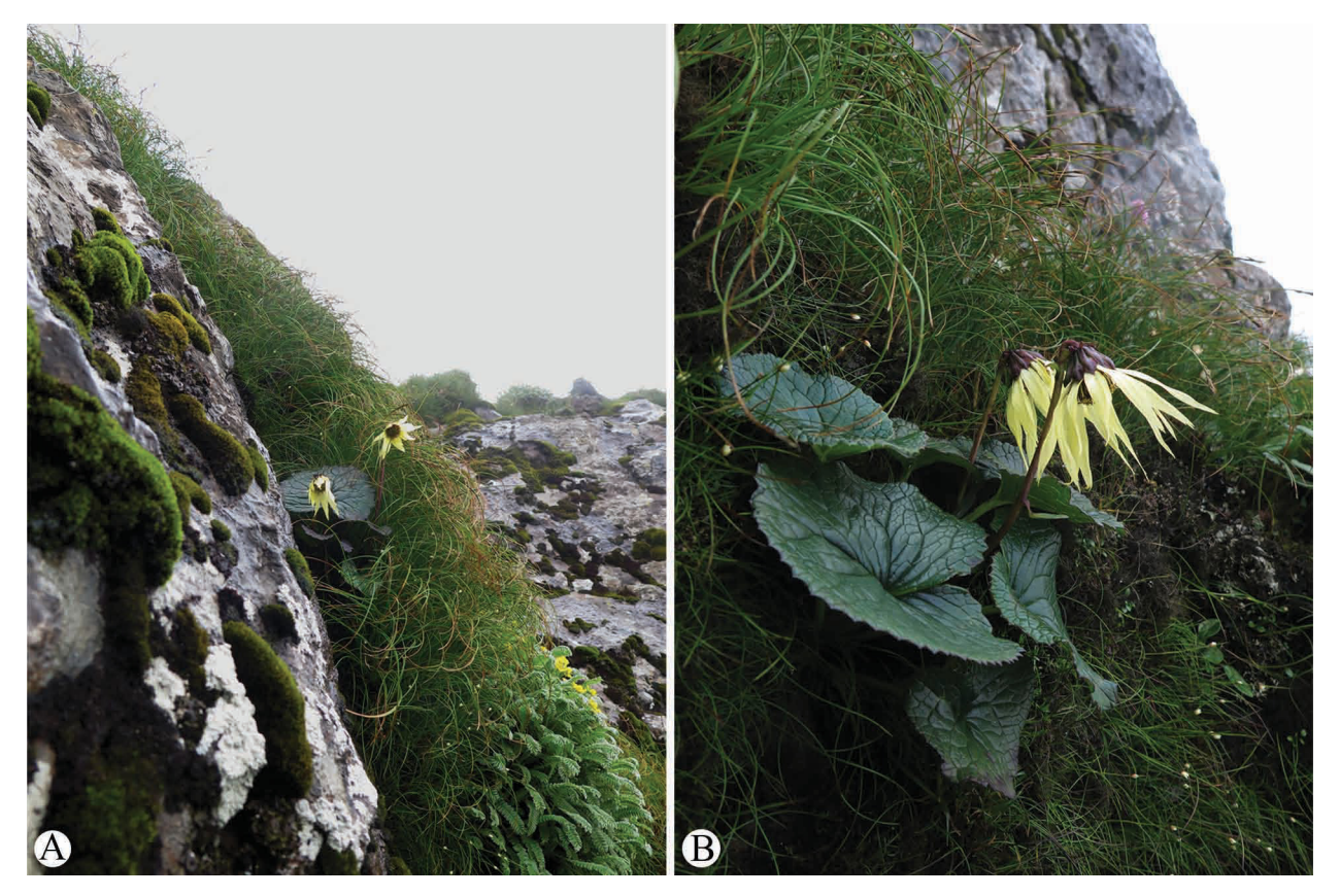
FIGURE 2. Cremanthodium wumengshanicum in the wild (Jiaozi Xue Shan, Luquan, Yunnan, China). A . Habitat. B . Habit.

Distribution and Habitat: — Cremanthodium wumengshanicum is currently known from northeastern Yunnan (Dongchuan, Luquan), China (Fig. 4). It grows in alpine meadows or cliff crevices between 3500 and 4300 m above sea level.