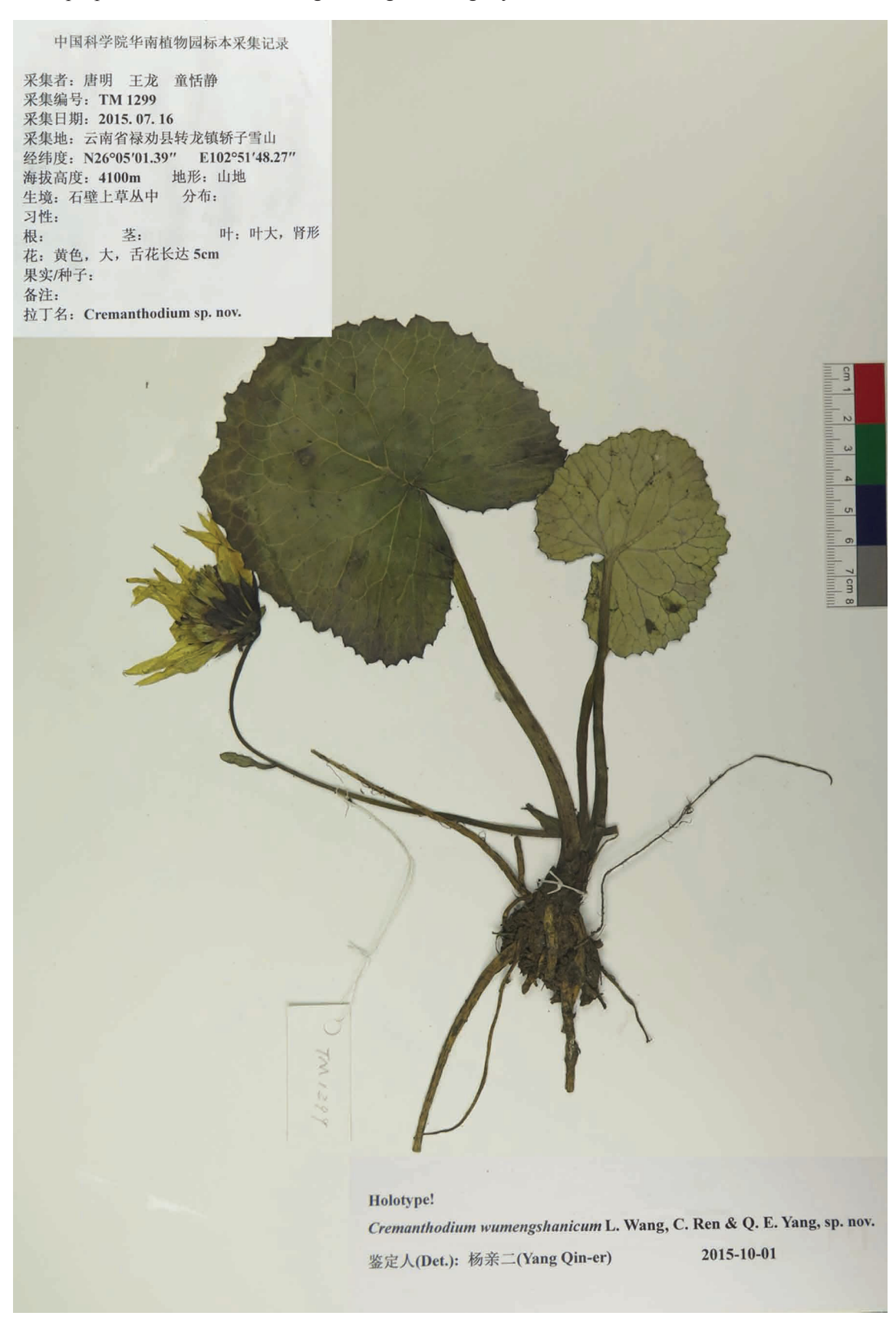
FIGURE 1. Holotype sheet of Cremanthodium wumengshanicum.

outer phyllaries lanceolate, apex acuminate or caudate; inner phyllaries oblong, margin membraneous, apex acuminate; bracts 10–14, oblong or narrowly ovate, 3–5 mm long, 2–3 mm broad, apex acuminate. Ray florets yellow; lamina lanceolate, 1–5 cm long, 4–7 mm broad, apex acute or acuminate, usually 3-denticulate. Tubular florets numerous, yellow, 1 cm long; tube 3 mm long; limb campanulate. Achenes brown, oblong, 3 mm long, 6–10-ribbed. Pappus white or sometimes purplish brown, 6–8 mm long, as long as or slightly shorter than tubular corolla.