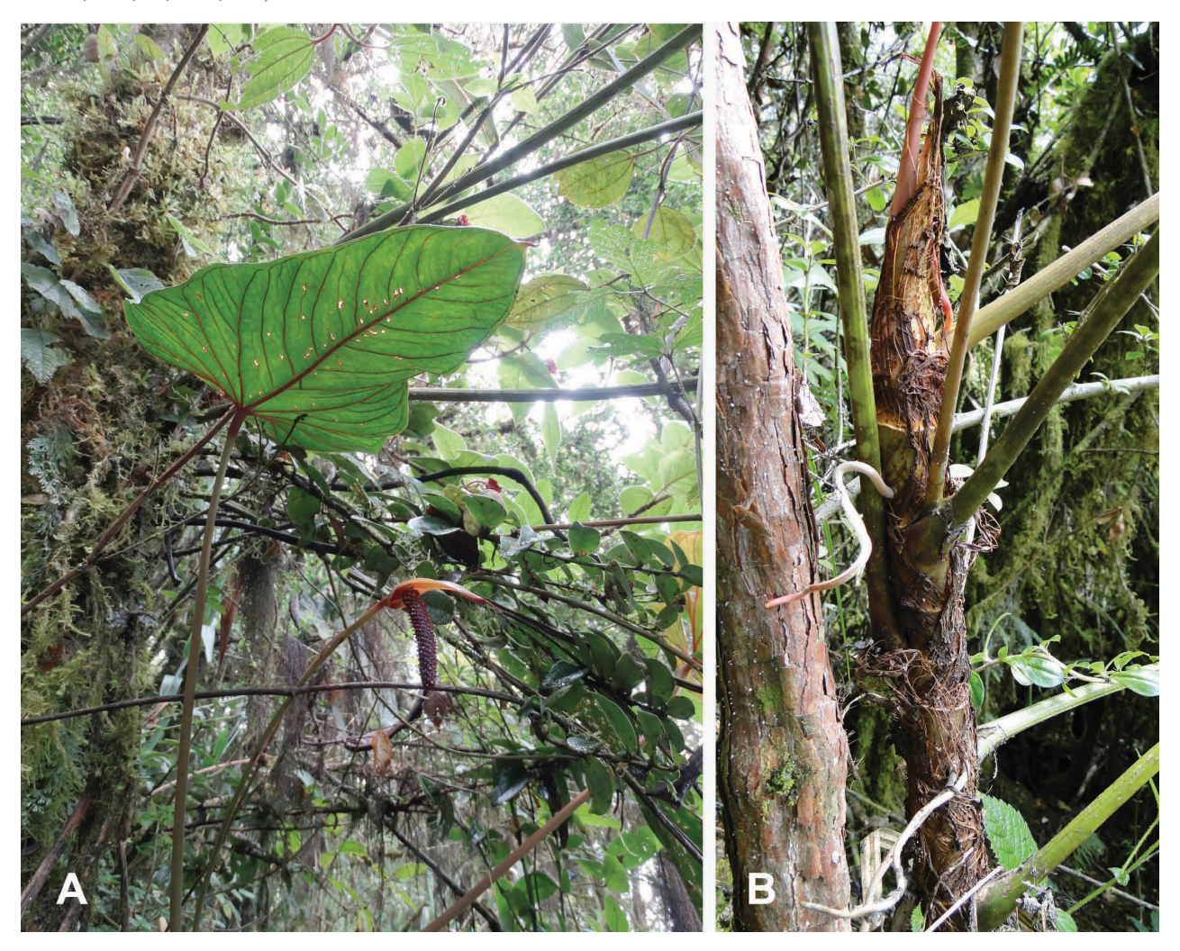
FIGURE 1. Anthurium yanacochense Croat, C.Ulloa & E.Freire. A. Habit. B. Leaf cataphylls.

Epiphyte; internodes short, 2–2.5 cm; cataphylls 17.6–24 cm long, acute persisting intact at apex, becoming loosely fibrous with fragments of reddish brown epidermis, the fibers reddish brown, mostly closely parallel; petioles 33.5–70 cm long, drying 5–8 mm diam., medium green, semiglossy, almost cylindrical, sharply and broadly sulcate adaxially, up to 5-ribbed on each side, rounded abaxially, densely short raised-lineate throughout, drying yellowish brown; geniculum 2.1–3.0 cm long, drying slightly darker than petioles; blades ovate-cordate-sagittate, 40–72.5 cm long, 26.8–45 cm wide, 1.45–1.74 times longer than broad, broadest at petiole attachment, 0.8 times long as petioles, gradually acuminate at apex, (acumen to 1.2 cm long), prominently deeply lobed at base, dark green and glossy above, moderately paler and semiglossy below, drying chartaceous, brownish green to gray-green and semiglossy above, greenish brown to grayish brown and semiglossy below, epunctate; upper surface densely granular-ridged; lower surface densely brownish speckled and granular; anterior lobe 27.5–52.5 cm long, with straight to slightly concave margins midway up, the distal margin slightly rounded; posterior lobes touching to slightly or markedly overlapping, 9.5–18.5 cm long, 9.0–15.5 cm wide, directed downward and inward; midrib drying narrowly raised, finely ribbed and darker above, narrowly rounded, finely ribbed and darker below; primary lateral veins 7–11 pairs,