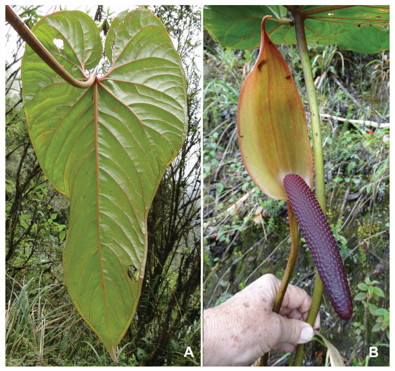
FIGURE 3. Anthurium yanacochense Croat, C.Ulloa & E.Freire. A. Leaf blade abaxial surface showing 5–7 pairs of basal veins, prominent posterior lobes and concave margin. B. Inflorescence showing erect greenish spathe and spreading purple-violet fusiform spadix.