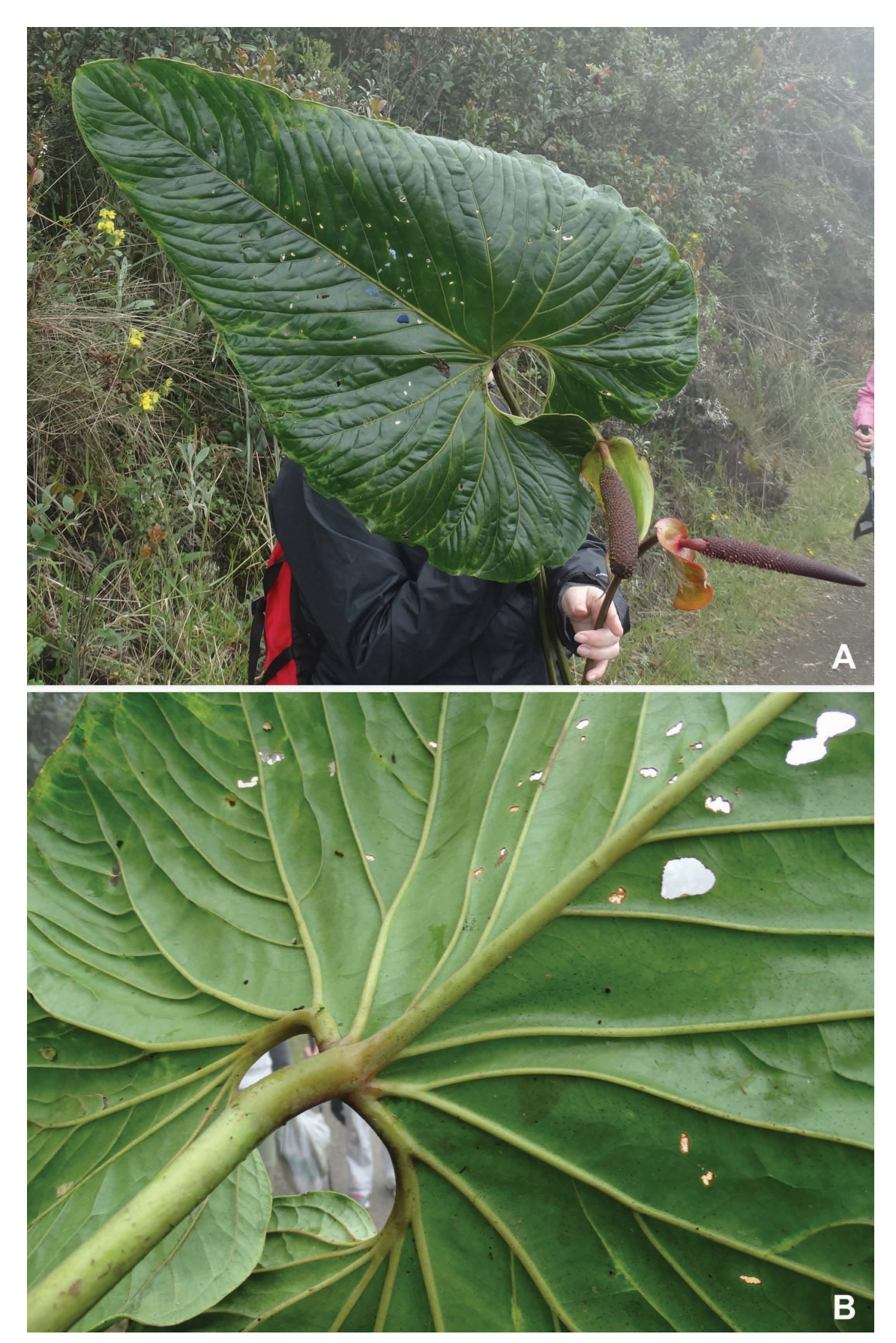
FIGURE 2. Anthurium yanacochense Croat, C.Ulloa & E.Freire. A. Leaf blade adaxial side. B. Leaf blade abaxial side showing 9 basal veins and posterior rib.