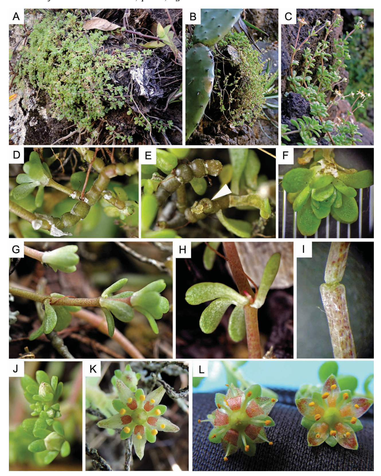
FIGURE 1. Sedum moniliforme and flowers of S. longipes . A–K. Type specimen(s) prior to conservation. L. A–B. Habit. C. Flowering stems and inflorescences. D–E. Rhizome-like basal stems with moniliform internodes (arrow indicates scar left by previous year's flowering stem). F. Sterile rosette. G–I. Flowering stems. G. General view (note the whorled leaves). H. Internode with four whorled leaves and adventitious roots. I. Stem node after the removal of leaves to show the markedly articulate internodes. J. Flower buds. K. Flower. L. Flower of S. longipes subsp. longipes (right) and subsp. rosulare (left).