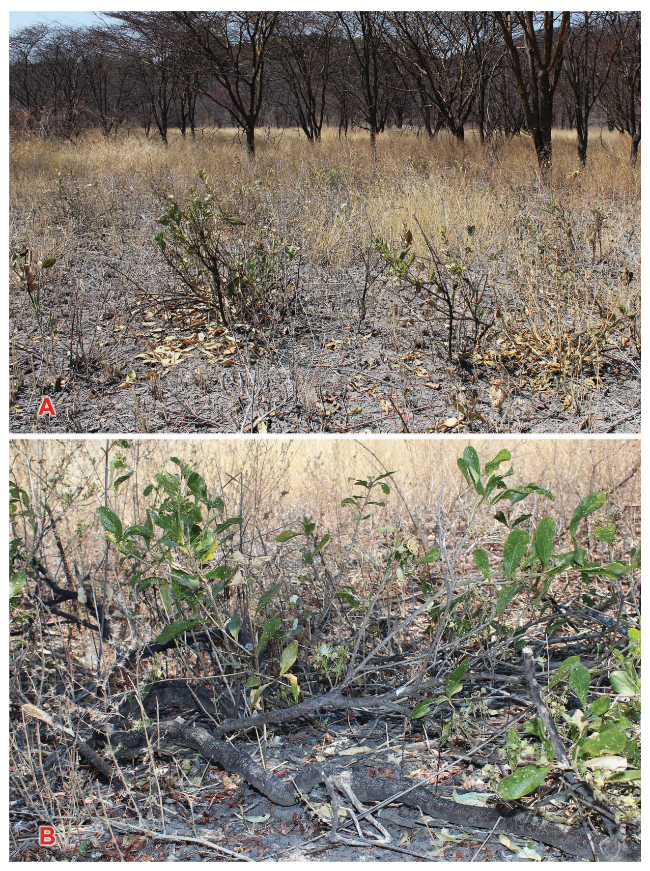
FIGURE 1. M. sebrabergensis in its natural habitat. A, clonal growth with several ramets in foreground, showing ascending shoots, \pm 0.7 m tall; trees in background are Acacia kirkii Oliver (1871: 350). B, suffrutex showing flood-exposed runner.