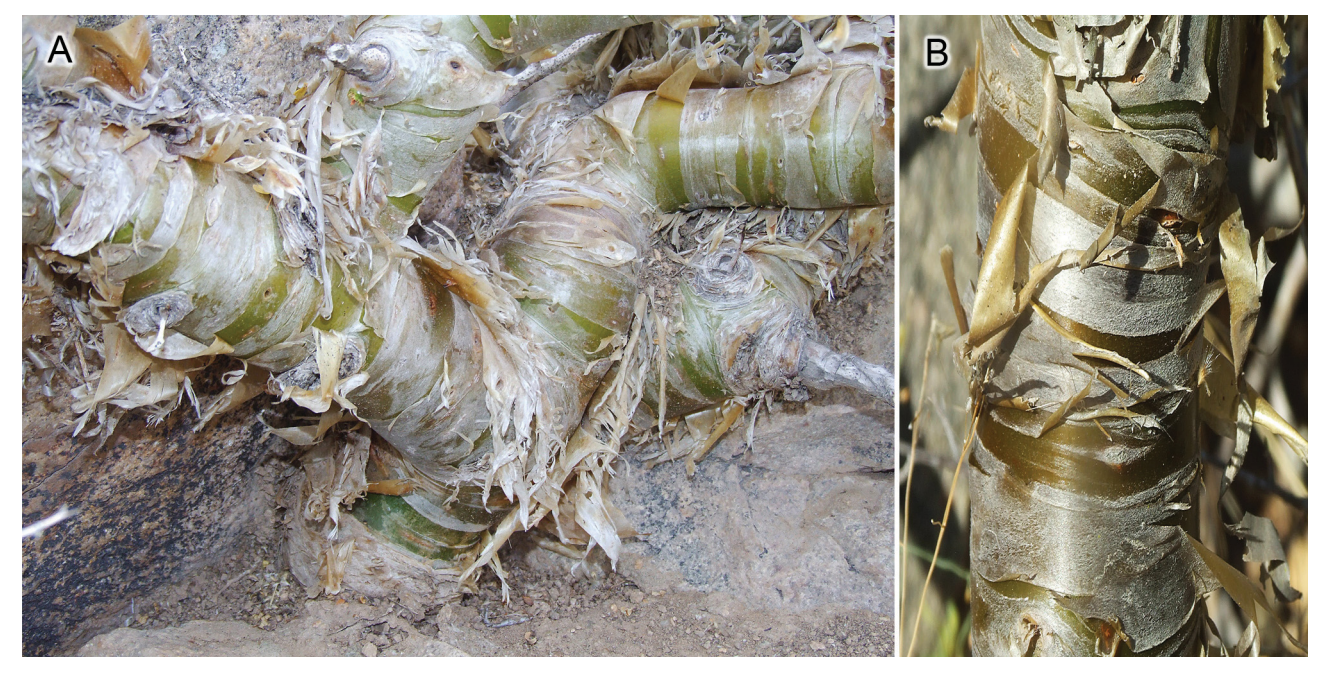
FIGURE 2. Commiphora namibensis. Old stems showing flaky bark. (A) Base of plant with low branching, growing tightly wedged among rocks; (B) trunk.