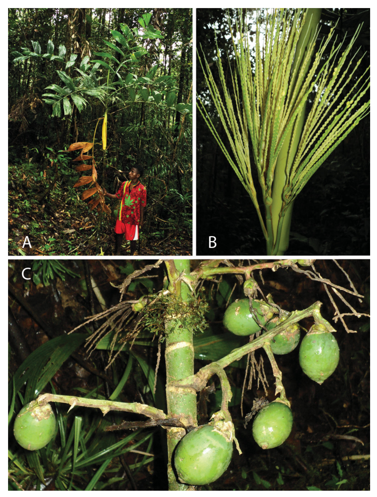
FIGURE 2. Areca unipa . A. Slender habit with long petioled leaves and the sigmoid multifold leaflets and broadly wedge-shaped terminal leaflets. B. Inflorescence starting to expand after the prophyll has fallen off. C. Infructescence with several young fruits. All photos were taken from the holotype specimen ( Iwanggin & Simbiak 138 ) in the forest near Ayata Village, East Maybrat, Maybrat, West Papua, Indonesia.