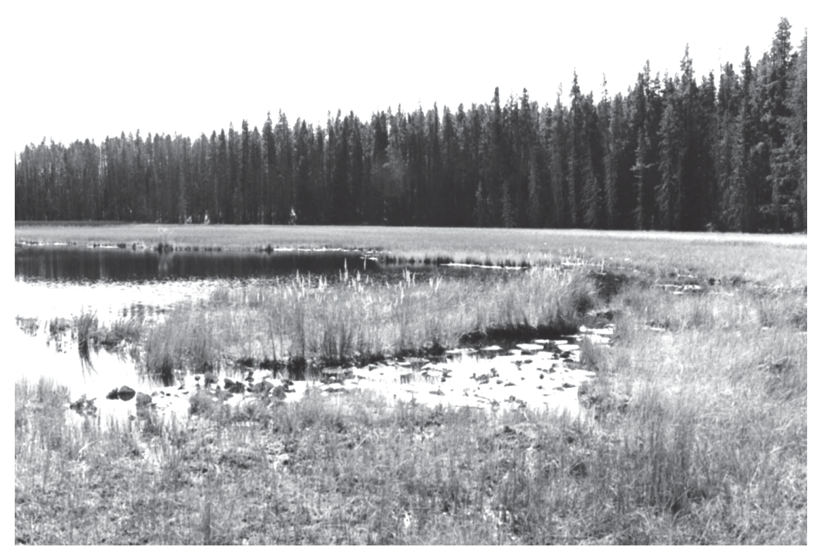
FIGURE 2: Floating-mat fen with central pool (site 4525). Site 4526 is similar but lacks a central pool of open water.