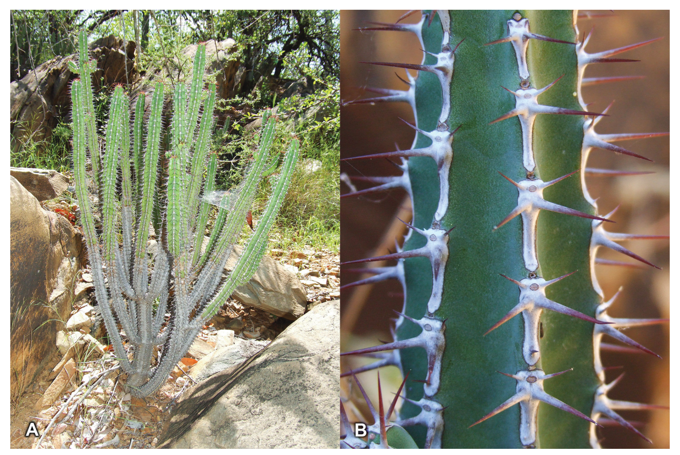
FIGURE 1. Euphorbia otjipembana subsp. okakoraensis: (A) plant in natural habitat, ± 0.8 m tall; (B) branch indicating spine shields.

Type: —NAMIBIA. Kunene Region: Stony northeastern slopes of Okakora Mountains near Okombambi, 1712BB, 930 m, 24 March 2007, Swanepoel 271 (holotype WIND!; isotype PRE!).