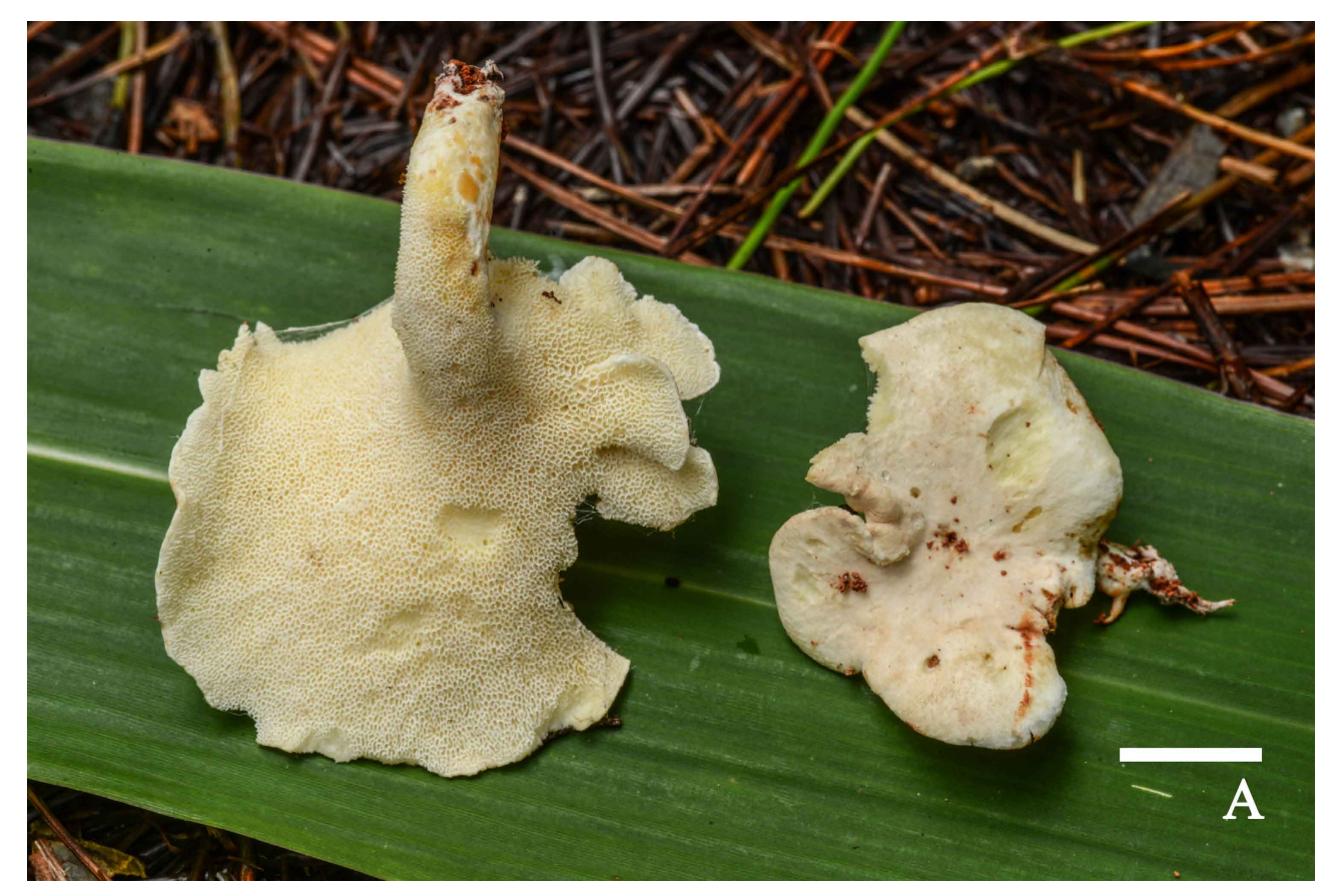
FIGURE 2. Basidiomata of Albatrellus aff. subrubescens (OR996). Scale bar = 1 cm. (Photograph by O. Raspé).

Basidiomes medium-sized, stipitate (Fig. 2). Pileus 35–50 mm in diameter; surface off-white to pale ochraceous, with faint pinkish hues at places when fresh, discoloring yellow when bruised, dull, dry, minutely and densely felted; margin inflexed becoming reflexed, irregular at places, with 1–3 clefts. Pileus context 7–8 mm thick at the centre of pileus, 3–4 mm thick half-way to the margin, slightly thinner at the margin, unchanging when bruised. Stipe excentric, cylindrical, 25-30 \times 4-7 mm, white to yellowish white, with white basal tomentum and rhizoids. Surface even, dull, dry, minutely and densely tomentose, slightly orange when bruised. Stipe context solid. Tubes 0.5–1 mm long, deeply decurrent at least on one side of the stipe, yellowish white. Pores irregular, 0.3–1.5 mm in diameter, regularly arranged, white, dry. Odor aromatic; taste not recorded.