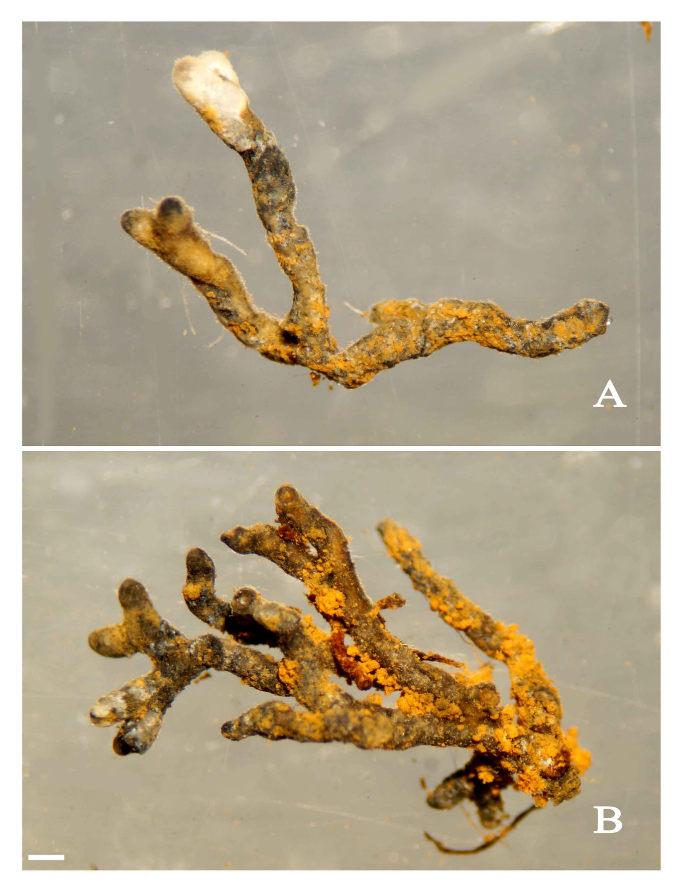
FIGURE 4. The two sequenced ectomycorrhized root tips of Pinus keziya / Albatrellus aff. subrubescens . A. Ectomycorrhiza showing white layer on one root tip. B. Ectomycorrhiza showing brown rhizomorphs. Scale bar: 0.2 mm.